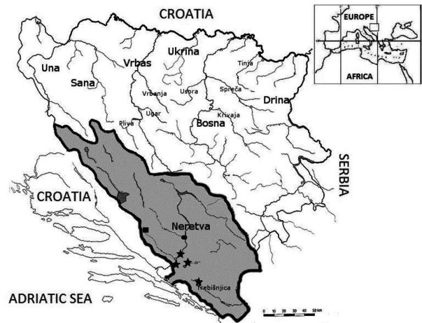
Fig. 4. Distribution of Cobitis illyrica , C. narentana and C. herzegoviniensis in Bosnia and Herzegovina based on literature data. Black rectangle indicate places where C. illyrica was recorded, black stars indicate C. narentana localities, while black dot shows record of C. herzegoviniensis . Danube (or Black Sea) catchment (unshaded), Adriatic Sea catchment (shaded).

Assesment of the extinction risk for the Bosnia and Herzegovina has not yet been made (Škrijelj et al. 2013), but the global estimation for C. illyrica is Critically Endangered (CR), (Freyhof & Kottelat 2008c).