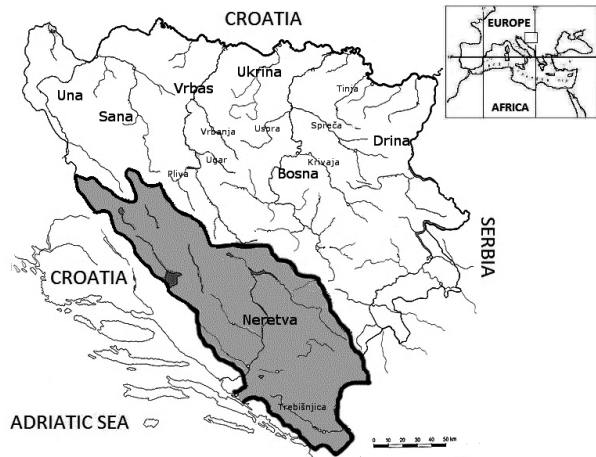
Fig. 1. Map of Bosnia and Herzegovina showing main catchments, Danube (or Black Sea) catchment (unshaded) and Adriatic Sea catchment (shaded).

distribution are very scarce, mostly based on species lists only lacking detailed descriptions of species and localities. According to the bibliographic data, a total of nine species of loach (eight Cobitidae and one Nemacheilidae) were reported from freshwaters within their geographical range (Vuković 1963, 1977, Bogut et al. 2006, Šanda et al. 2008a, b, Sofradžija 2009, Buj et al. 2014, 2015a, b, Golub et al. 2016). However, some of the data are in obvious conflict with the current taxonomy. Based on all available data it is clear that reports on the presence of Cobitis taenia Linnaeus, 1758 in Bosnia and Herzegovina are a result of taxonomic imprecision and it cannot be expected that this species inhabits waters of Bosnia and Herzegovina, because its distribution range is restricted to northern Europe (Nalbant et al. 2001). Bosnia and Herzegovina was thought to be a part of this species' range since C. taenia was considered to have extremely wide distribution through Palearctic region (Nalbant et al. 2001). However, already Bacescu (1962) reported C. taenia to be an assemblage of morphologically similar, but phylogenetically distinct species.