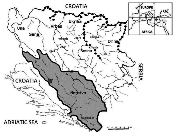
Fig. 5. Distribution of Misgurnus fossilis in Bosnia and Herzegovina based on literature data. Danube (or Black Sea) catchment (unshaded), Adriatic Sea catchment (shaded).

southern haplotype, that is closest to the Bosnia and Herzegovina, was located in the Poganovo polje (Croatia, Park of Nature Lonjsko polje). This sample revealed specific population different from all other samples and localities. Authors also considered that southern-eastern part of the range was a refuge area for the species during the glaciation events in the Pleistocene. Another ecologically similar lowland species Umbra krameri Walbaum, 1792, was shown to be also genetically different in the Sava River basin (Marić et al. 2017). Phylogeography of this species has been investigated in Danube and Dniester drainages, and it has been found that population from Sava River basin belongs to specific phyletic lineage (haplogroup) and could be considered as potential Evolutionary Significant Units (ESU). Therefore, it is possible that southern part (Bosnia and Herzegovina) of the M. fossilis population in Sava River basin could be slightly genetically different from all other populations, and could represent an evolutionary significant unit. This need further investigation.