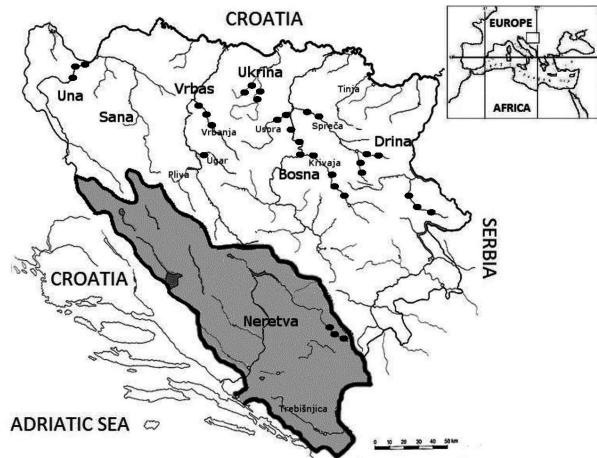
Fig. 7. Distribution of Barbatula barbatula in Bosnia and Herzegovina based on literature data. Danube (or Black Sea) catchment (unshaded), Adriatic Sea catchment (shaded).

As no major threats are recognised, it is included as LC species in the IUCN Red List (Freyhof 2011b) and the Red List of fauna of the Federation of Bosnia and Herzegovina (Škrijelj et al. 2013), respectively.