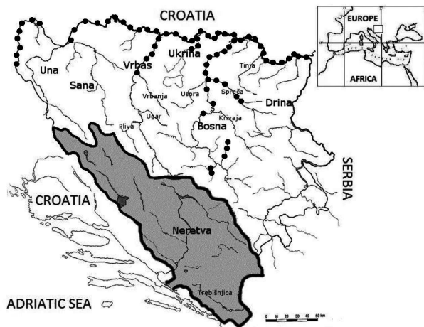
Fig. 2. Distribution of Cobitis elongata in Bosnia and Herzegovina based on literature data. Danube (or Black Sea) catchment (unshaded), Adriatic Sea catchment (shaded).

Habitat destruction, extraction of water for irrigation as well as industrial, agricultural and untreated sewage pollution are recognised as the main threats (Mrakovčić et al. 2008). It is categorized as Least Concern (LC) species in the IUCN Red List (Freyhof & Kottelat 2008a) and the Red List of fauna of the Federation of Bosnia and Herzegovina (Škrijelj et al. 2013).