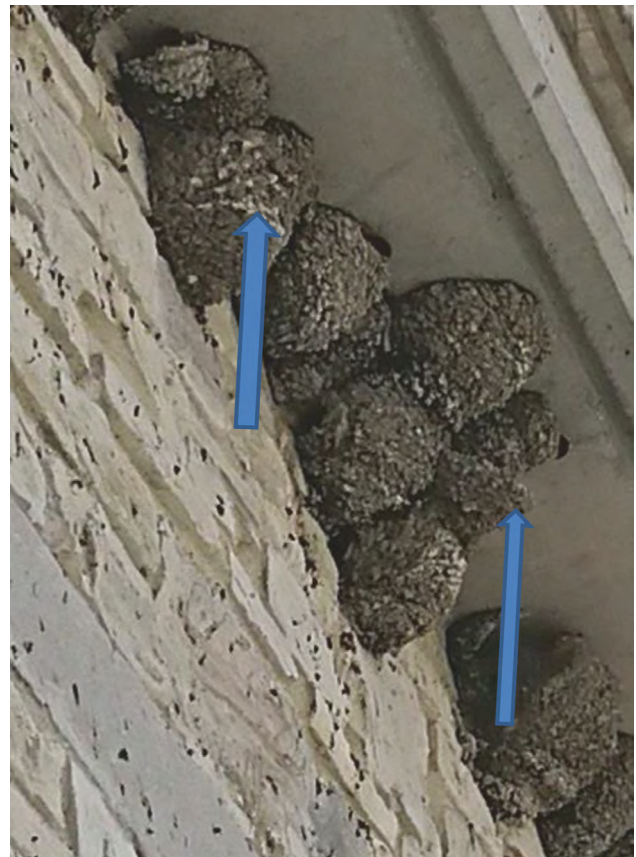
Fig. 2. A colony of house martins in which house sparrows have succeeded in appropriating nests at the 'cup' stage and successfully laid their own eggs in them (arrows). Completed and occupied house martin nests are evident around these usurped nests.

Upon continued attempts by the house sparrows to take over the partially built nest (Fig. 1), we observed a shift in the behaviour of the house martins. Observations were recorded on a cellular phone as photos and short video-clips.