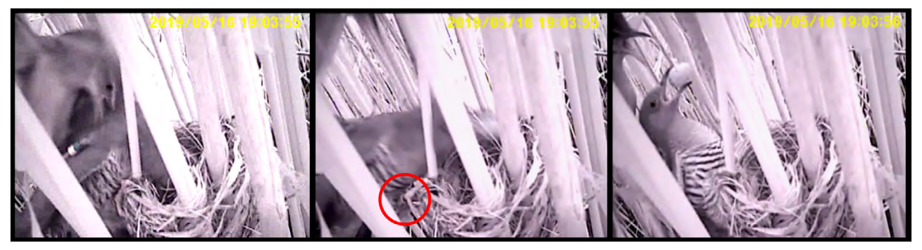
Fig. 2. Screenshots from the video-recording in which a female common cuckoo was knocked down from the nest by the great reed warbler female. The nest contained three host eggs and the cuckoo removed one of them during the attacks by the host female. The female cuckoo did not lay her own egg. The second frame shows that the cuckoo had a ring on her right tarsus (in the red circle). For the whole video, see supplementary online material.