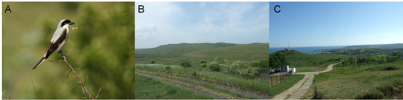
Fig. 1. Photographs documenting (A) studied species, the lesser grey shrike ( Lanius minor ), and habitat types differing in the level of anthropogenic disturbance inhabited by this species on the Crimean Peninsula, including (B) rural (Beherove; 45°26'01" N, 36°14'55" E; 15 May 2013), and (C) suburban areas (Kercz lighthouse; 45°23'08" N, 36°38'13" E; 19 May 2013).

et al. 2014, Moss et al. 2014). For example, European and Australian bird species with declining populations are less tolerant of an approaching human than species with increasing populations (Møller et al. 2014). Escape behaviour of animals is affected by several factors, such as the distance at which an approach begins (Blumstein 2003, Tryjanowski et al. 2020, Mikula et al. 2021), body mass and overall pace-of-life strategy (Stankowich & Blumstein 2005, Weston et al. 2012), sex and age (Kalb et al. 2019), flock size (Morelli et al. 2019, Tryjanowski et al. 2020), but also more subtle risk cues, such as human gaze and head orientation (Bateman & Fleming 2011, Clucas et al. 2013), and directness (Møller & Tryjanowski 2014) and speed of approach (Stankowich & Blumstein 2005). Based on their traits, some species are expected to have a decreased ability to cope with human disturbance and the identification of these may help in their conservation management (Samia et al. 2015b). However, the flexibility in behavioural responses towards human presence remains unexplored for many populations and species of animals.