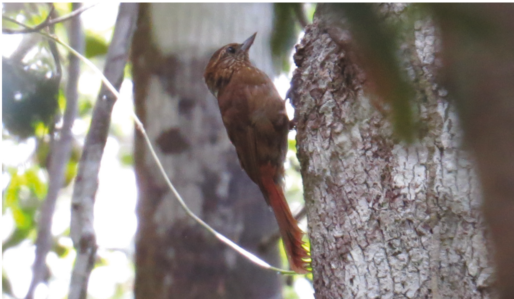
Figure 1. Wedge-billed Woodcreeper Glyphorhynchus spirurus cuneatus , municipality of Itaporanga D'Ajuda, Sergipe, Brazil, March 2016 (Saulo Silvestre)

Our record of G. spirurus represents an extension of the species' range in eastern Brazil (BirdLife International 2017) by c.195 km north (Fig. 2), based on the published literature. However, two previously unpublished specimens for Sergipe are held at the Museu de Zoologia da Universidade de São Paulo (MZUSP 83411–412). These were collected by