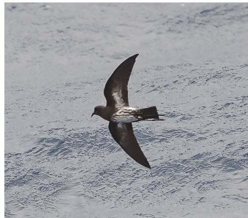
Figure 8 (left). Coral Sea Storm Petrel (undescribed taxon?), Britannia Seamount, Coral Sea, Australia, 13 April 2014. Extensive dark markings in the white underwing panels, mainly in the primary-coverts, and heavy streaking on the white belly, including the central belly, give a dirty appearance. Figure 9 (right). New Caledonian Storm Petrel (undescribed taxon?), New Caledonia, south-west Pacific Ocean, 20 March 2013. Note long front-end projection, long tail and broad wings compared to the Fiji New Zealand Storm Petrel Fregetta maoriana , which is an altogether more compact bird.