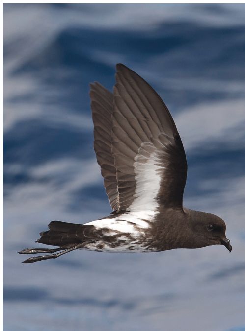
Figure 10 (left). New Zealand Storm Petrel Fregetta maoriana , off North Cape, North Island, New Zealand, 2 March 2013 (Kirk Zufelt). In dorsal view very similar to Wilson's Storm Petrel Oceanites oceanicus , but the head is Fregetta -like (see main text) and the ulnar bars on the upperwing are subdued.