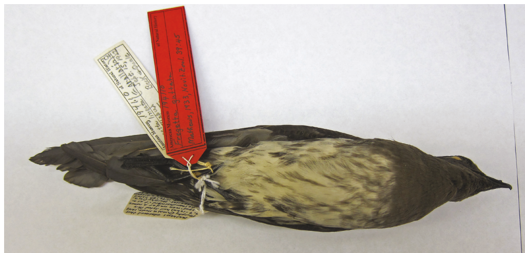
Figure 6. Specimen AMNH 194110 (American Museum of Natural History, New York) collected by Rollo Beck off Huapu Island (Ua Pou), Marquesas Islands, 15 September 1922, during the Whitney South Seas Expedition (Angus C. Wilson). A distinct form of White-bellied Storm Petrel Fregetta grallaria (Cibois et al. 2015, Robertson et al. 2016). Note streaking across underparts, including central belly, albeit not as heavy as the Samoa specimen (USNM A15713; see Fig. 7).

However, the rediscovery of the streaked New Zealand Storm Petrel in 2003, off the Coromandel Peninsula and in the Hauraki Gulf, North Island (Flood 2003, Saville et al. 2003, Stephenson et al. 2008b), provided a breakthrough in our understanding of streaked storm petrels, while simultaneously refuting Murphy & Snyder’s (1952) argument that all such individuals are plumage variants of known species (the so-called Pealea phenomenon). Live captures of streaked storm petrels in the Hauraki Gulf followed these sightings and subsequent morphological and molecular studies indicated that they are the same species as three historic specimens at the Muséum national d’Histoire naturelle, Paris (France) and Natural History Museum, Tring (UK), i.e. a distinct taxon—the New Zealand Storm Petrel—and not a plumage variant (Stephenson et al. 2008a, Robertson et al. 2011). Further research established that New Zealand Storm Petrel breeds in February–July in the Hauraki Gulf (e.g. Rayner et al. 2013, Tennyson et al. 2016).