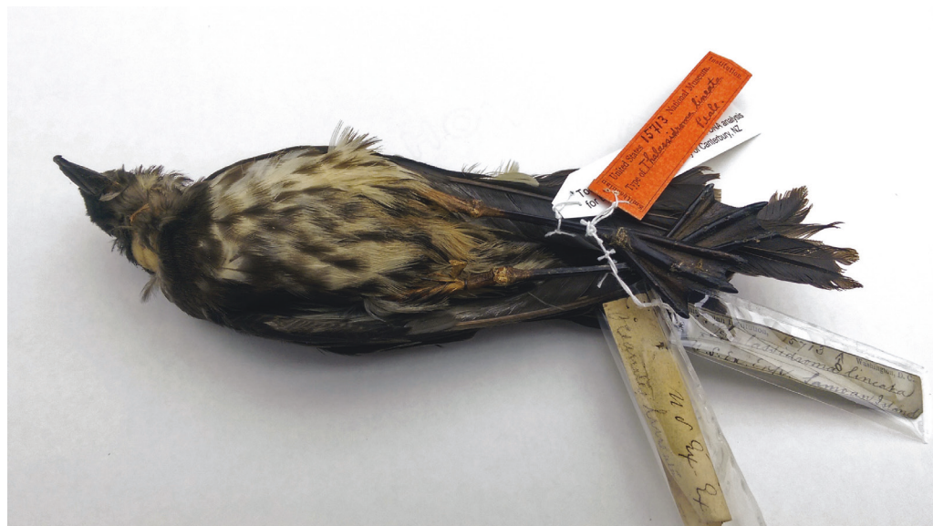
Figure 7. Specimen USNM A15713 (Smithsonian Institution, Washington DC) obtained perhaps October / November 1839, US Exploring Expedition 1838–42, Upolu, Samoa (Brian K. Schmidt). Considered to be a Black-bellied Storm Petrel Fregetta tropica (Murphy & Snyder 1952, Gill et al. 2010). Note heavy streaking across underparts, including the central belly; outer and middle toes of comparable length.

The following recent developments cast further light on the streaked storm petrel conundrum. On 7 April 2008, a single (or two) streaked storm petrel was photographed off southern New Caledonia during a Western Pacific Odyssey expedition cruise, operated by Heritage Expeditions (RLF was an observer). Howell & Collins (2008) made the reasonable suggestion, at the time, that it was possibly a New Zealand Storm Petrel. However, given further sightings in subsequent years, in the same region, it is apparent that these birds—now labelled 'New Caledonian Storm Petrel'—are not New Zealand Storm Petrel (Collins 2013). In 2013 and again in 2014, separate teams led by C. Collins and P. Harrison tried to