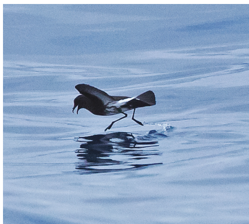
Figures 4–5. New Zealand Storm Petrel Fregetta maoriana , off Gau Island, Fiji, 20 May 2017 (Angus C. Wilson). Dorsal view suggests Wilson's Storm Petrel Oceanites oceanicus but the bird's foot-pattering shown in Fig. 5 is inconsistent with the 'dance' of Wilson's Storm Petrel (Flood & Fisher 2013).

afternoon chumming sessions (Figs. 2–5). Photographs revealed that just one individual was involved. Feather abrasion featured distinctive nicks and notches (Fig. 3). Identification was based on our previous experience of the species and the criteria in Flood (2003) and Stephenson et al. (2008a).