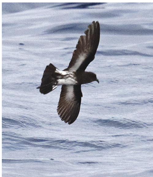
Figures 2–3. New Zealand Storm Petrel Fregetta maoriana , off Gau Island, Fiji, 20 May 2017. Note clean-looking, largely white central underwing panel and dark streaks mainly restricted to sides of lower breast and belly, as well as white bases to underside of outer rectrices (at least r5 and r6).