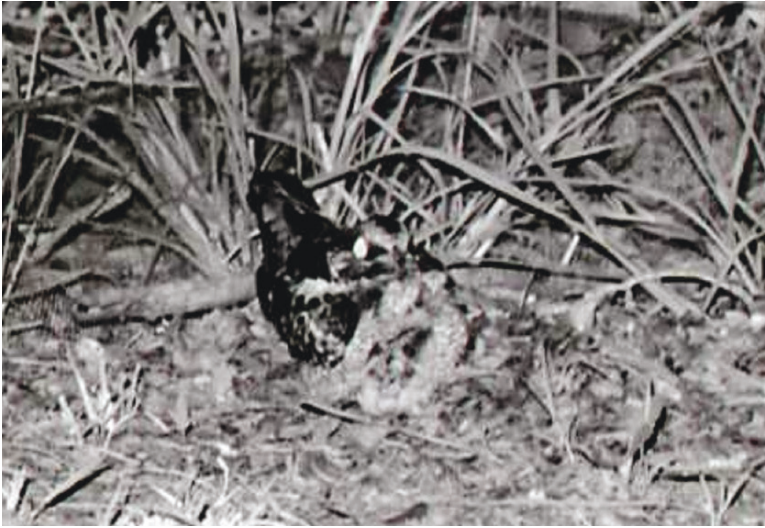
Figure 9. On day 6 at Muneni the fence shown in the background prevented the Fiery-necked Nightjar Caprimulgus pectoralis chicks from reaching the adult; as soon as the adult flipped over the fence the chicks ran across to be fed (H. D. Jackson)