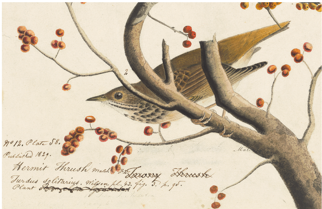
Figure 6. Cropped image of Audubon's original painting of Hermit Thrush T. solitarius (= Catharus guttatus faxoni), showing his mistaken identification ('Tawny Thrush,' crossed out). The painting was executed with watercolour, graphite, pastel, black ink and gouache on paper, laid on card (N-YHS no. 1863.17.58). The inscription in the lower left reads: 'No 12. Plate 58. / Published 1829. / Hermit Thrush Male 1. F. 2. Tawny Thrush [crossed out] / Turdus solitarius. Wilson pl. 43. fig. 3. p. 95. / Plant Bromelia lycis...[crossed out]'. The painting was signed below in graphite: 'John. J. Audubon.'

as Audubon claimed. But the breeding range of Hermit Thrush extends all the way to far eastern Labrador, matching Audubon's description of Tawny Thrush range. This discrepancy supports the hypothesis that when Audubon heard Hermit Thrushes ( C. g. faxoni ) sing in the distance, he incorrectly identified them as Tawny Thrushes; recall, he thought Hermit Thrush was mute (Audubon 1831: 303). Audubon's original painting of Hermit Thrush (N-YHS no. 1863.17.58) provides further evidence that he confused these species: below the image, Audubon initially labelled his illustration 'Tawny Thrush,' but sometime later crossed it out and wrote 'Hermit Thrush' (Fig. 6).