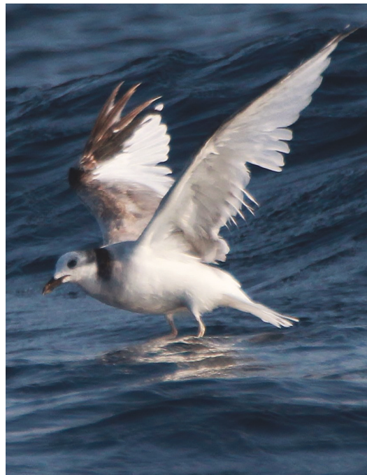
Figure 3. Second-calendar-year Sabine's Gull Xema sabini , north of Inhaca Island, Mozambique, 10 May 2015 (Gary Allport)

Breeds in the Holarctic and migrates south through the Atlantic Ocean to spend the austral summer off southern Africa (Hockey et al. 2005). Rare in Mozambique, the first record was by Lambert (1983), followed by another four, all in February–April north of Inhaca Island (Lambert 2005), including one