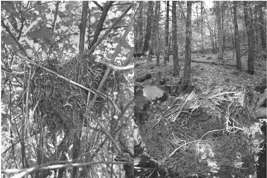
Figure 2. The environs and possible nest of Russet Nightingale-Thrush Catharus occidentalis , Sierra del Carmen, Coahuila, Mexico, June 2007. Clockwise from left: an old nest from the side, with dense moss still largely intact, but most pale twigs / grass have fallen off (some still visible hanging from the nest); the steep slopes of the ravine in which the nest was sited; the same nest from above, showing the thickness of the moss cup and the carefully constructed lining of rootlets and conifer needles

pale grey. The bird sang almost continuously until we left at 10.15 h. We returned on 7 June 2007 and were able to record two brief song bouts using a digital camera ( http://www.xeno-canto.org/357625 , http://www.xeno-canto.org/357626 ). A bandpass-filtered version has also been uploaded to Macaulay Library (ML85671051), where the identification was confirmed by reviewers. Near the singing bird, we noted the presence of at least four old nests that resembled those of other Central and South American Catharus and Turdus species (ETM, H. F. Greeney & V. Rohwer pers. obs.; Fig. 2). We departed the study site on 10 June 2007, and made no further observations of the bird. This site is c.425 km north of the nearest known population, near Monterrey, Nuevo León. While our evidence of breeding is far from conclusive, the large number of nightingale-thrush-like nests in the ravine, and extensive singing throughout the day for 24 days suggests at least a male advertising for a mate.