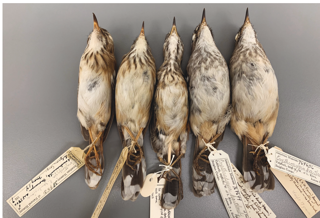
Figure 3. Specimen of White-browed Scrub Robin Cercotrichas leucophrys collected near Beya, Central African Republic (AMNH 832113, middle, left) and two C. leucophrys munda (Baudouinville, Democratic Republic of Congo, left) and two Brown-backed Scrub Robins C. hartlaubi (Tshibati, Kivu, Democratic Republic of Congo, right)