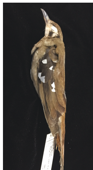
Figure 4. Specimen of Grey Ground Thrush Geokichla princei (AMNH 832142) collected at Bayanga, Central African Republic

A female was collected in forest at Bayanga (02°54'N, 16°15'E) on 23 June 1998 by P. Beresford (AMNH 832142; Fig. 4). There