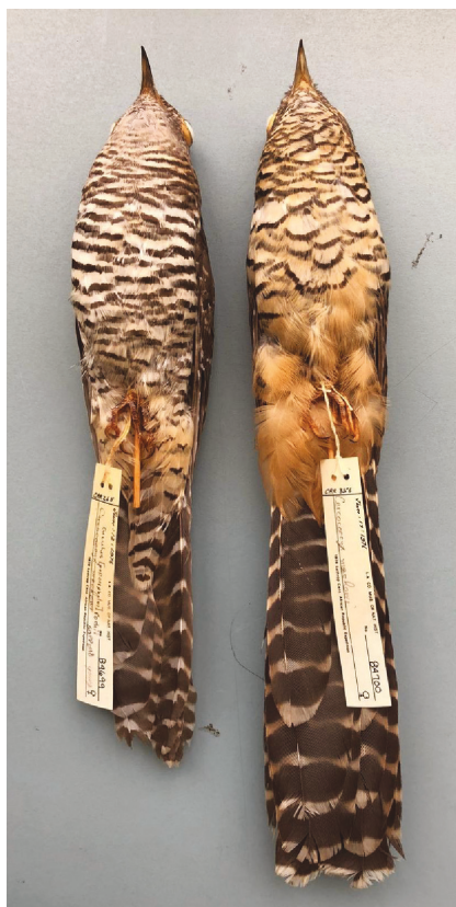
Figure 1. Cuckoo specimens held in Los Angeles County Museum and collected near Baroua, Central African Republic: Madagascar Lesser Cuckoo Cuculus rochii (LACM 84699, left) and Dusky Long-tailed Cuckoo Cercococcyx mechowii (LACM 84700, right)

The largely grey throat (with a few dark-barred feathers), folded wings extending far towards the tip of the tail and basic measurements (wing 158 mm, tail 139 mm) suggest that it is attributable to either Asian Lesser Cuckoo Cuculus poliocephalus or Madagascar Cuckoo C. rochii . These two species are very similar (being often treated as conspecific in the past) and have long caused confusion both in the field and