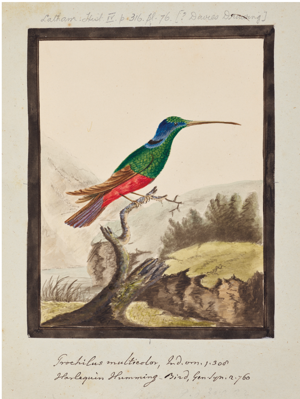
Figure 4. Original watercolour of the Harlequin Hummingbird, now held among six volumes of Latham's drawings in the NHMUK Dept. of Library and Archives (vol. 3, no. 447)

the Harlequin, and in having the green on the crown extend a short distance down the back of the neck. Unfortunately, the originals of neither Nodder's nor Edwards' paintings seem to be available for study, so the extent to which differences may be attributable to