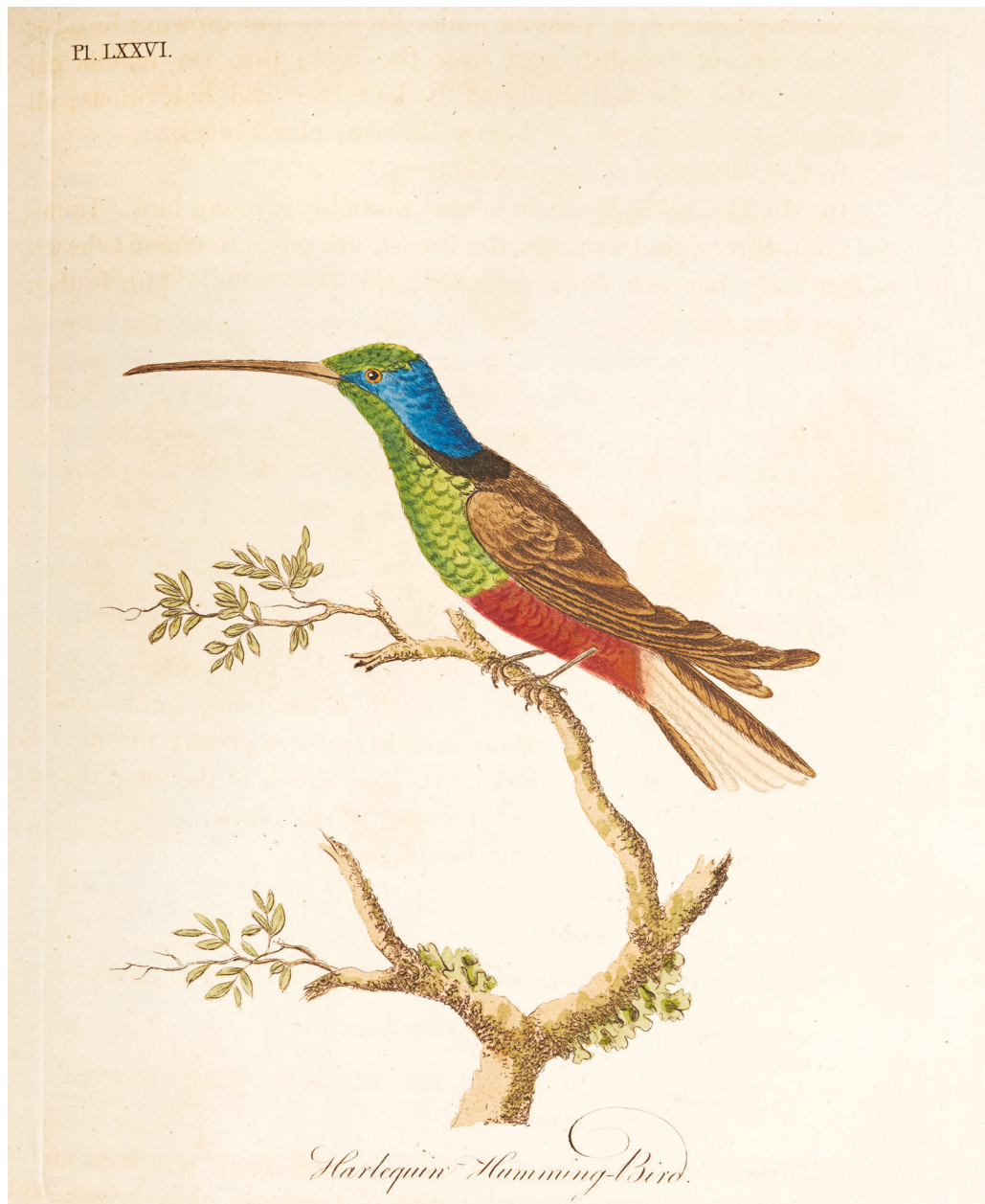
Figure 3. Plate of the Harlequin Hummingbird from Latham (1822, pl. 76).

the black on the back of the neck, the upper part of the back greenish and the underside of the tail verging to purplish on its inner feathers.