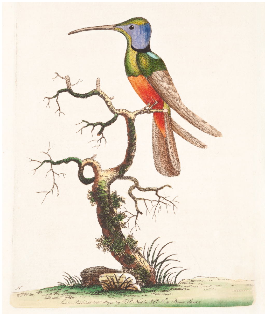
Figure 5. Plate of the Harlequin Hummingbird by Frederick Nodder in Shaw & Nodder (1791, pl. 81).

the colourists employed cannot be judged. It was Edwards' image that was used by The encyclopedia Americana (Fig. 1).