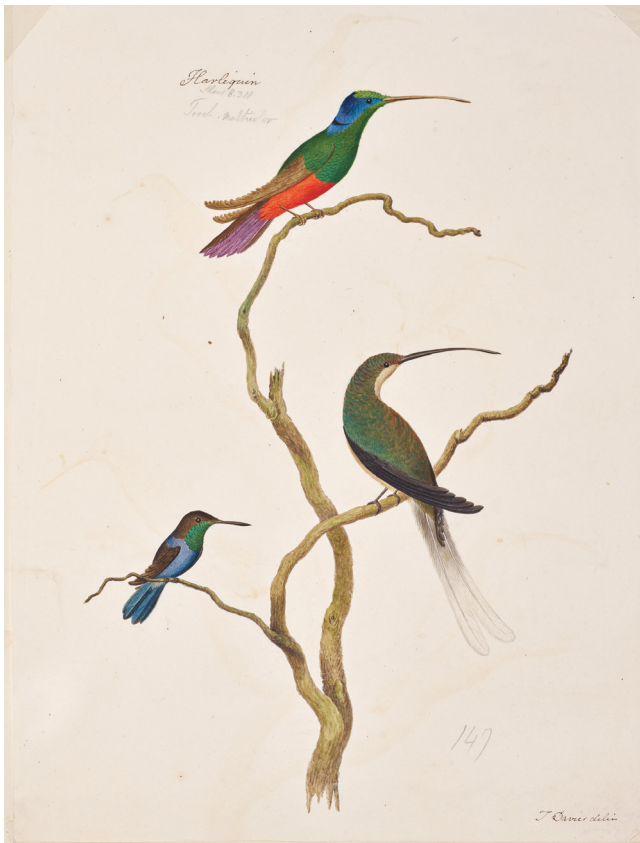
Figure 7. (a) Original watercolour by Thomas Davies that includes the Harlequin Hummingbird, held by the NHMUK Dept. of Library and Archives (Davies volume, sheet 107, no. 147); (b) close-up of the Harlequin Hummingbird from (a) (© Natural History Museum, London)