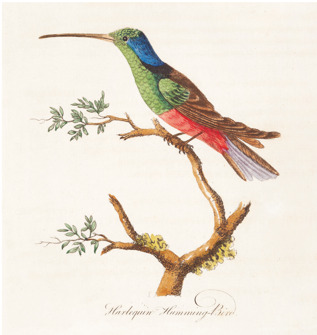
Figure 2. Plate of the Harlequin Hummingbird from Latham (1787, pl. 111).

Latham's 1782 and 1787 descriptions and his 1787 plate provided the entire source material on which Gmelin (1788) based his brief Latin type description of Trochilus multicolor . Subsequently, Latham (1790: 308) adopted Gmelin's scientific name, while including in his Latin species outline an enigmatic phrase that translates as 'in some of which there is a blue-green patch below the nape'.