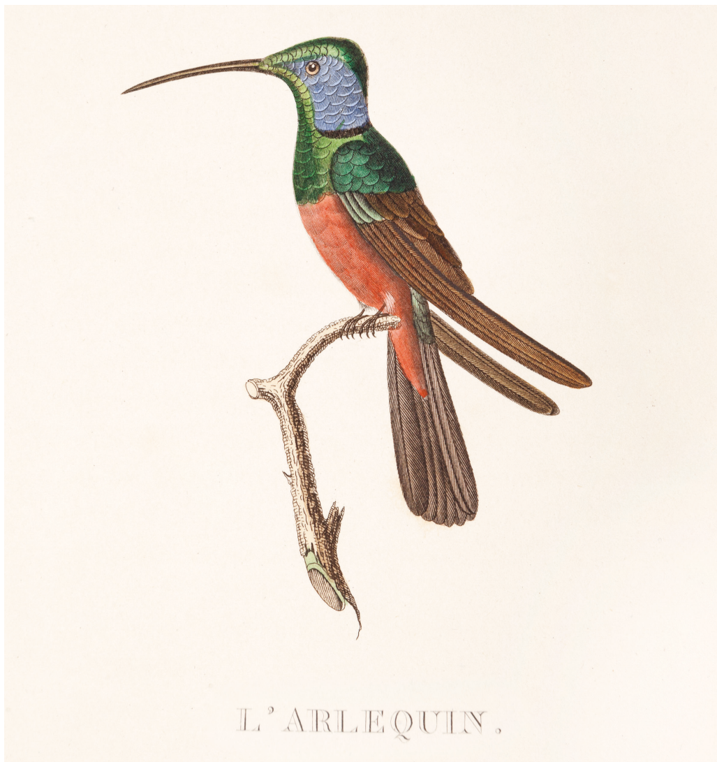
Figure 6. Plate of the Harlequin Hummingbird by Sydenham Edwards in Audebert & Vieillot (1802, pl. 69).

Audebert & Vieillot (1802) and coloured similarly, but explicitly stated that he did so with great reservation and merely for the sake of completeness. He even wondered, largely on the basis of its plumage colours, whether it was actually a sunbird that had been described; seemingly, he was not at this point aware of Latham's (1822) footnote. Subsequently, however, Lesson (1831: xiii) stated unambiguously that (translation): ' M. Stokes writes to us that the bird that served as the type for Latham's description and for the figure copied by Vieillot was the product of a fabrication, and that it had been discovered on deconstructing the specimen preserved in the British Museum. '