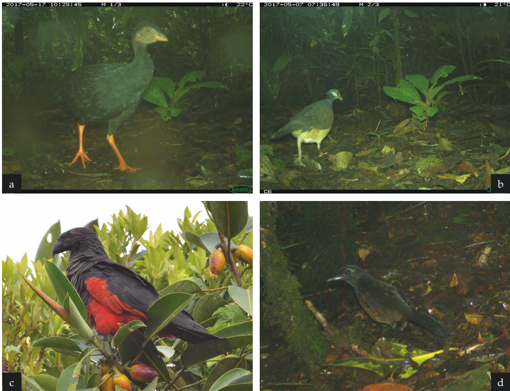
Figure 2(a) Red-legged Brushturkey Talegalla jobiensis ; (b) Thick-billed Ground Pigeon Trugon terrestris ; (c) New Guinea Vulturine Parrot Psittrichas fulgidus ; (d) Greater Melampitta Megalampitta gigantea , all camera-trapped in the Agogo Range.