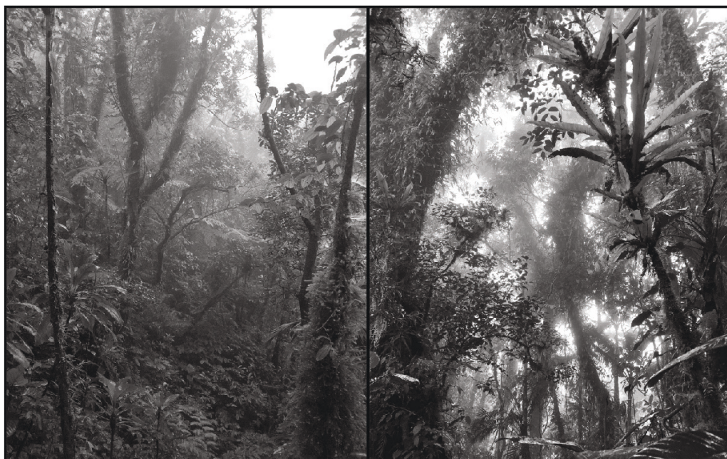
Figure 2. Examples of mossy montane forest on the Kubonitu-Sasari massif, Isabel Island, Solomon Islands (Lucas H. DeCicco)

Univ. of New Mexico, and Ecological Solutions Solomon Islands in 2018. The information we present improves our knowledge of distribution, abundance and ecology of birds in the region, and on Isabel.