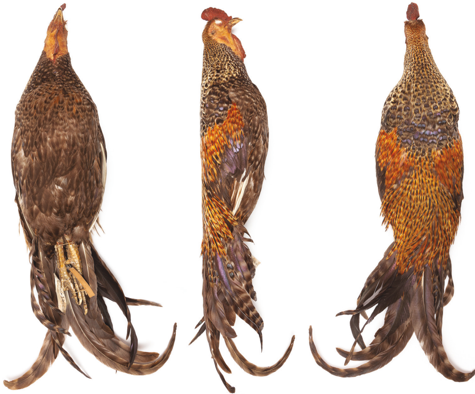
Figure 11. Male hybrid between Green Junglefowl cock and domestic chicken hen, bred and kept in the London Zoological Gardens in the 1850s and after its death donated to the British Museum (Natural History) (NHMUK 1857.11.9.1); the remarkable dark and pale barring on the feathers (the cuckoo pattern) is the result of a colour aberration known as ‘sex-linked barring’ which was inherited from the domestic hen; compare this specimen with the bird in Fig. 13

feather transversely barred with darker lines, so as to resemble in some degree the plumage of the cuckoo’ (Darwin 1868a: 244). By the term ‘analogous or parallel variation’ Darwin meant that similar characters occasionally occur in different varieties or races descended from the same species or, more rarely, in widely distinct species and was implying that these markings signified a reversion to an ancestral character.