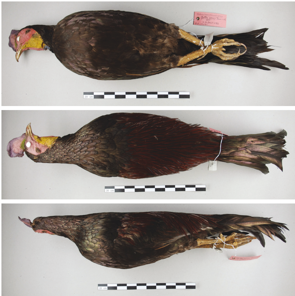
Figure 5. Holotype of Gallus aeneus Temminck, 1825 (MNHN.ZO.2013.42), collected by Pierre-Médard Diard between December 1818 and August 1819 on Sumatra

as such (Voisin et al. 2015). The specimen was first figured, together with his description, in Temminck's Planches coloriées (1825, pt. 63, pl. 374; see Fig. 6).