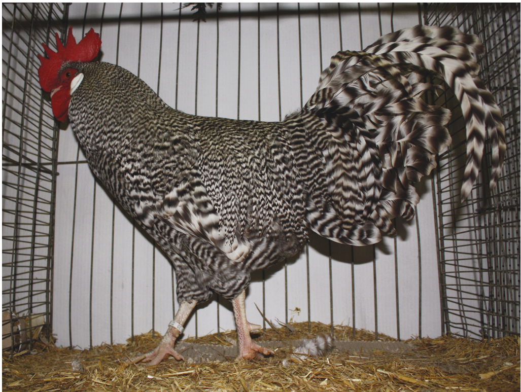
Figure 12. German Cuckoo, a breed of domestic chicken, male, in the traditional cuckoo pattern, commonly referred to as 'barred' by chicken fanciers, which is the combination of two different mutations; Black (gene symbol E ), a dominant mutation which turns the wild type colour solid black, and sex-linked barring (gene symbol B ) which switches the production of melanin on and off during feather growth, resulting in alternating pale and coloured transverse bars over the length of each feather

These Bornean skins were probably those that Darwin encouraged Tegetmeier to exhibit, together with those of other Asiatic domestic fowl, at a meeting of the Zoological