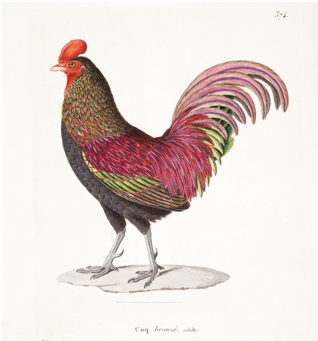
Figure 6. Lithograph of Gallus aeneus , 'the Bronzed Cock', pl. 374 in Temminck's Planches coloriées (1825); the lithograph was after a drawing by the French natural history illustrator Nicolas Huet le Jeune

Museum. The English explanation (Raffles 1822, Raffles 1830: 372–373, 702–723), however, was that all the collected material belonged to the East Indian Company as the latter paid the collectors a monthly salary for their work, but that nevertheless the French had secretly sent many objects to Cuvier in Paris, including their notes and drawings. Whatever the truth, Diard and Duvaucel did send specimens to France, including this cock supplied to the Paris museum by Diard during his stay in Bangkok (Voisin et al. 2015).