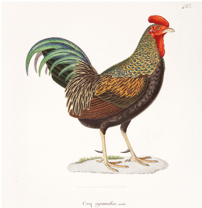
Figure 2. Lithograph of Gallus furcatus , 'ayam-alas', pl. 483 in Temminck's Planches coloriées (1829); the lithograph was after a drawing by the French natural history illustrator Nicolas Huet le Jeune (1770–1830)