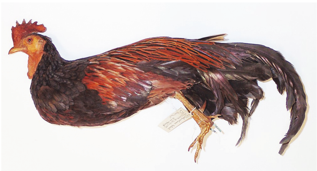
Figure 10 (below). Holotype of Gallus violaceus Kelsall, 1891 (ZRC 3.30131); at the time of description, 1891, this bird was still alive in the Singapore Botanic Gardens, but after it died was donated to the, then, Raffles Museum