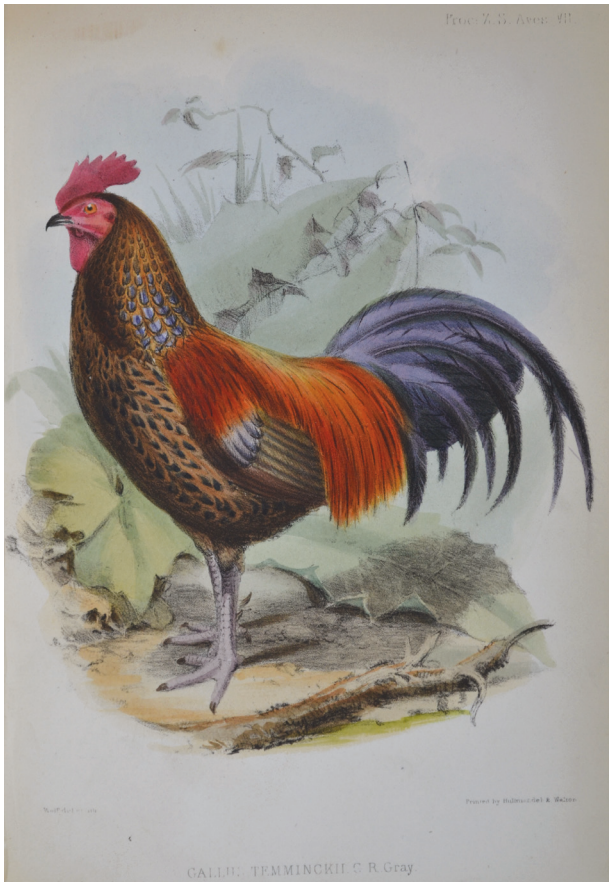
Figure 8. Engraving by Joseph Wolf (1820–99) of the holotype of Gallus temminckii , in Gray 1849