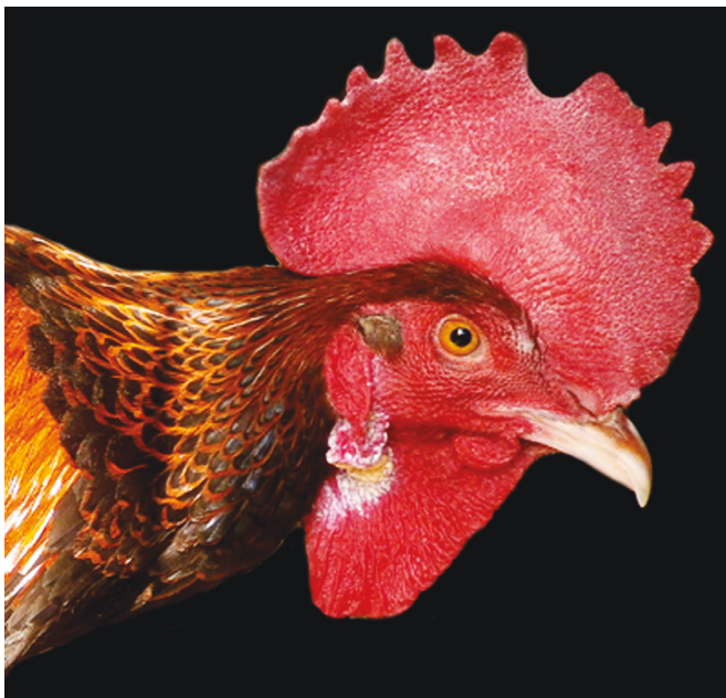
Figure 4 (left). Bekisar; a hybrid between a Green Junglefowl cock and a domestic chicken hen; the single throat wattle of Green Junglefowl is dominant in inheritance over the double wattles in chickens and therefore present in hybrids