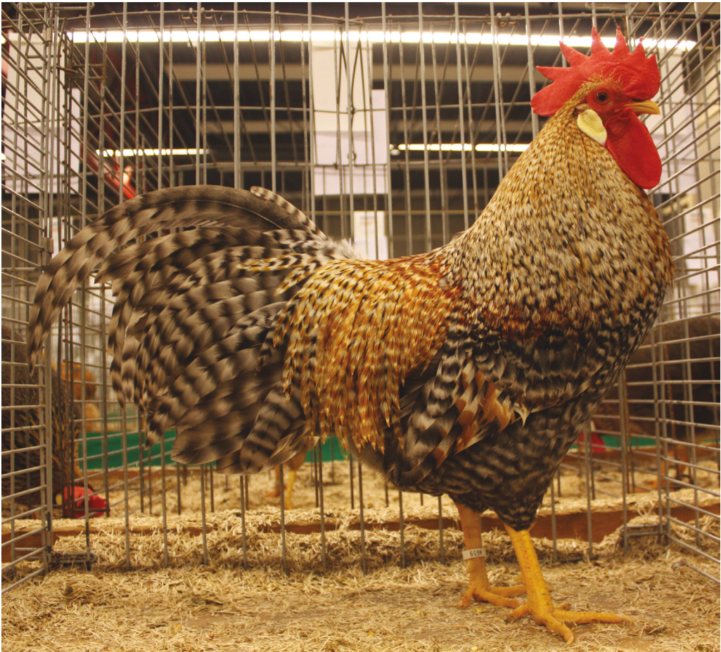
Figure 13. Leghorn, a breed of domesticated chicken, male, in the variety 'gold barred', which is the result of the effect of sex-linked barring alone, without any other mutation; as sex-linked barring affects eumelanin (black) more than pheomelanin (reddish brown), the alternating pale and coloured transverse bars are less conspicuous in the 'golden' parts of the plumage; compare this bird with the specimen in Fig. 11

Society (Anon. 1857, Darwin 1857, Tegetmeier 1857). Their current whereabouts, if they still exist, are unknown to us.