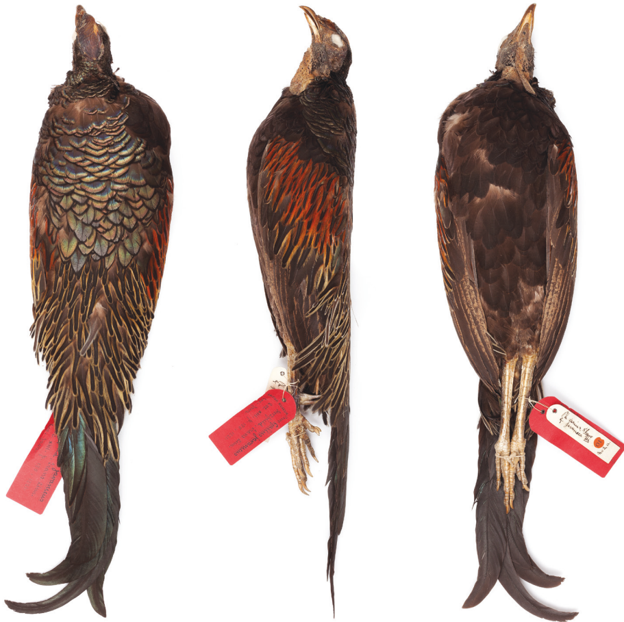
Figure 3 (above). Type specimen of Gallus javanicus Horsfield, 1822 (NHMUK Vel.Cat. 34.2a), collected in Java by Horsfield between 1811 and 1817, during which period Java formed part of British possessions in Indonesia