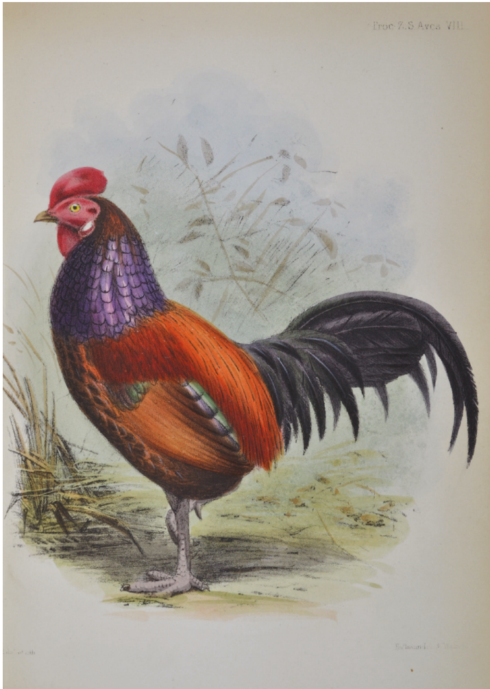
Figure 9 (left). Engraving by Joseph Wolf of a hybrid junglefowl similar to Gallus aeneus , which was present in the London Zoological Gardens at the time, in Gray 1849