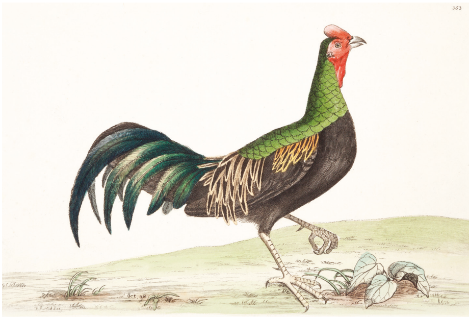
Figure 1. Pl. 353, Variegated Pheasant Phasianus varius in Shaw 1798