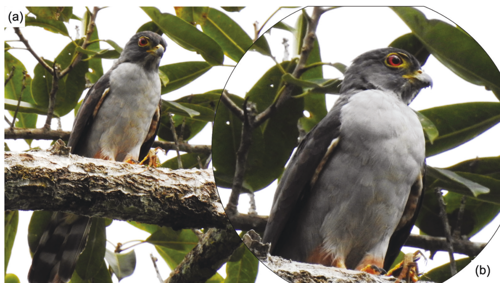
Figure 1. First documented record of Rufous-thighed Kite Harpagus diodon , dpto. Amazonas, Colombia, June 2019, showing (a) predation of a lizard, and (b) the two notches in the maxilla (William Daza-Díaz).

2,607 records were from the breeding season (Fig. 2a), 56 during northbound migration (Fig. 2b), 260 during the non-breeding season, including our own record (Fig. 2c), and 209 during southbound migration (Fig. 2d). Additionally, the first breeding / migration overlap category in March accounted for 90 records, and the second breeding / migration overlap category in October for 369 (Fig. 2).