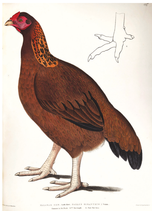
Figure 3. Pl. 45, Malabar hen Gallus giganteus , by Benjamin Waterhouse Hawkins in Gray & Hardwicke's Illustrations of Indian zoology