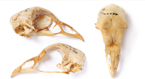
Figure 8A–B. Two Cochin skulls from Darwin’s collection, right a male, NHMUK 1868.2.19.70 (Darwin’s no. 48) and left a hen, NHMUK 1868.2.19.55 (Darwin’s no. 60). Sectioning of the hen’s skull was performed by (or for) Darwin, as it was needed for a picture on p. 263 in Variation under domestication, 1868, vol. 1 (see Fig. 8B), wherein it is stated that the skull is of a male