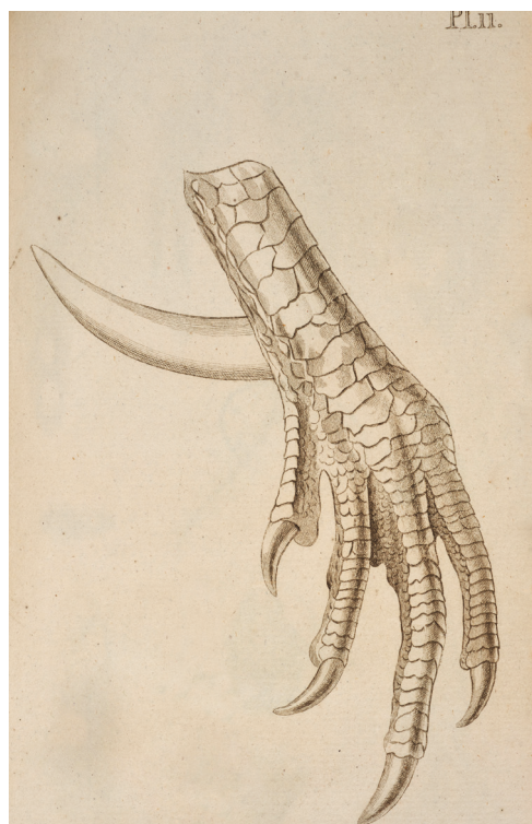
Figure 1. Pl. 2 in Temminck 1813, depicting the foot of Gallus giganteus