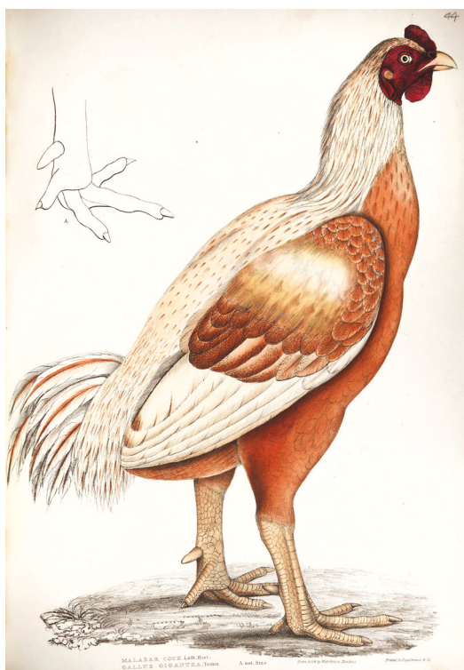
Figure 2. Pl. 44, Malabar cock Gallus giganteus , by Benjamin Waterhouse Hawkins in Gray & Hardwicke's Illustrations of Indian zoology (© Ben Nathan, Natural History Museum, London)

Marsden (1754–1836) had used the name ‘Jago’—from the Sumatran or Malay ‘Jago’ for a breed of chicken used for cockfighting (Dixon 1848: 176)—writing ‘The jago breed of fowls, which abound in the southern end of Sumatra, and western of Java, are remarkably large: I have seen a cock peck off of a common dining table: when fatigued, they sit down on the first joint of the leg, and are then taller than the common fowls’ [this typical resting position is displayed by many large, long-legged, fighting breeds] (Marsden 1783: 98).