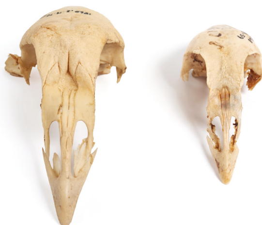
Figure 9. Dorsal view of a Cochin skull NHMUK 1868.2.19.70, left, showing a deep groove along the middle of the frontal bone, compared with Red Junglefowl G. gallus skull NHMUK 1868.2.19.59, right, showing the flat surface to the frontal bone