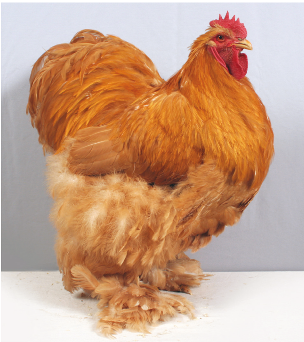
Figure 7. Buff Cochin cock; the Cochin, first introduced into Britain in 1847, does not originate from Cochinchina (Vietnam) but from China and is kept purely for exhibition. The Cochin is in many aspects very different from other breeds but, according to Darwin (1868: 260), ‘All the characteristic differences of the Cochin breed are more or less variable and may be detected in greater or lesser degree in other [Chinese] breeds’