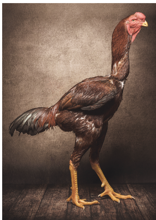
Figure 4. Black-breasted Red Malay cock, one of the tallest breeds of chicken, originally bred for cockfighting but nowadays for exhibition alone

the same as Temminck's G. giganteus . The birds pictured resemble the Aseel, an Indian breed used for cockfighting (see Appendix 2).