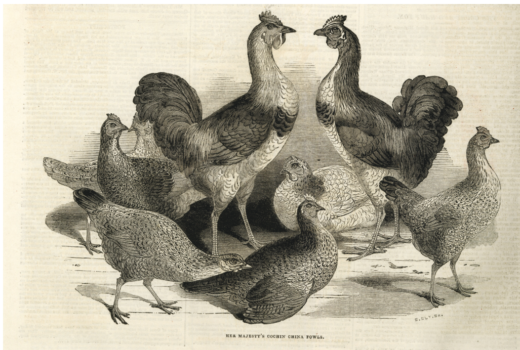
Figure 5. Engraving of the Cochin China Fowl kept by Queen Victoria at Windsor, by Samuel Read (1816–83), published on 23 December 1843 in The Illustrated London News