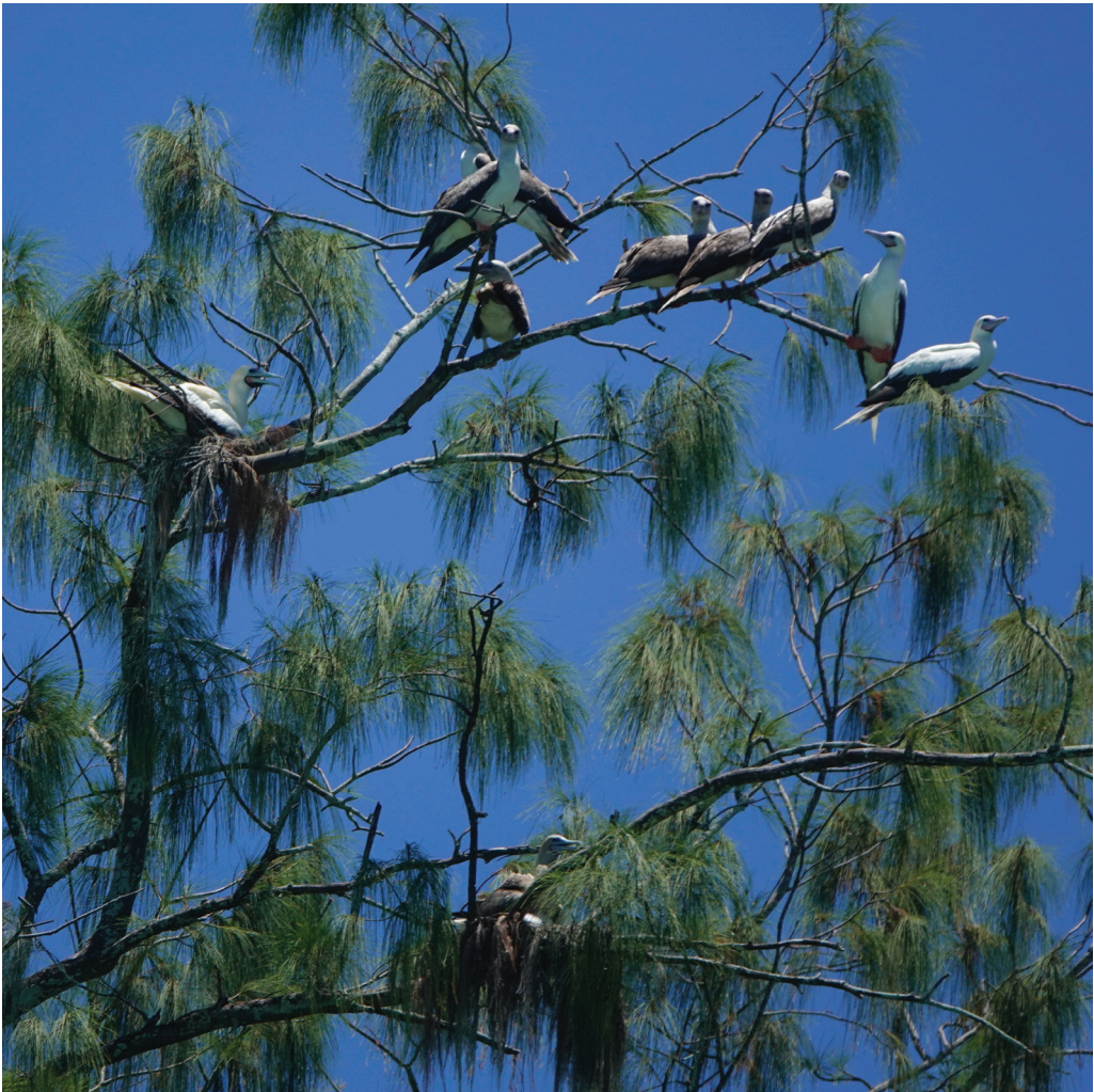
Figure 4. Nesting Red-footed Boobies Sula sula , Pianau, Hermit Islands, October 2019 (Sue Muller Hacking)

Hermits 3 October 2019: Pianau c.300, with 124 nests (17 with chicks) mostly high on open branches of Casuarina with a few in dense mangrove (Fig. 4); on Pekhu, c.200 birds and at least 40 active nests, a few with chicks (photographed); and on Leabon, the smallest island, with fewest Casuarina , c.100 with c.10 nests (2–3 with chicks) (SMH). These are the first observations of nesting in Northern Melanesia west of Tench, and also apparently the first of the species breeding in Casuarina trees (Schreiber et al. 2020).