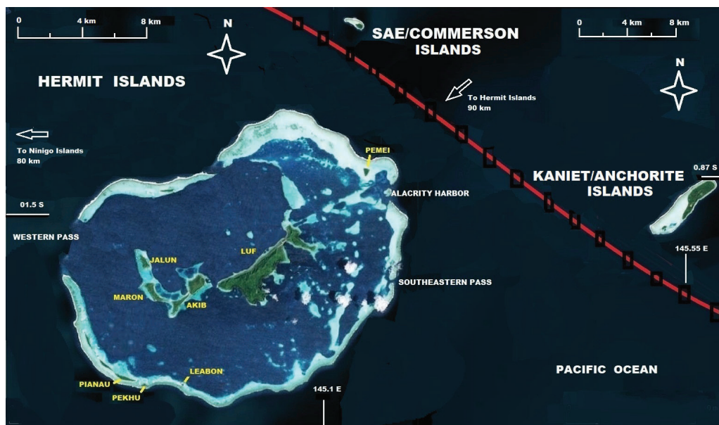
Figure 2. The Hermit Islands, showing all of the islets mentioned in the text; the Sae and Kaniet Islands are shown at a different scale (based on www.Bing.com/maps/aerial ).

covered in coconut palms, Casuarina , mangrove, Terminalia catappa and Pandanus sp., which makes penetration of more than a few dozen metres into the interior near-impossible. The south-west coralline islands support similar vegetation with tall Casuarina predominating. Dense vegetation made casual access impossible. These islands are uninhabited except three families that reside on the eastern tip of Pianau (37 ha).