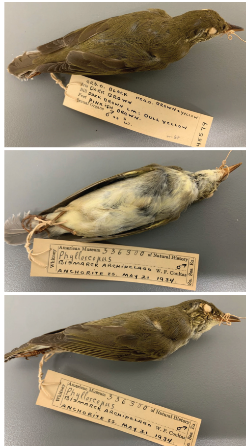
Figure 7. Specimen of the Arctic Warbler Phylloscopus borealis complex (perhaps race kennicottii ), collected by W. F. Coultas in the Kaniets, May 1934

This northern Palearctic and Alaskan breeder winters largely in South-east Asia (Lowther & Sharbaugh 2020) including Indonesia as far east as the Moluccas (Coates & Bishop 1997).