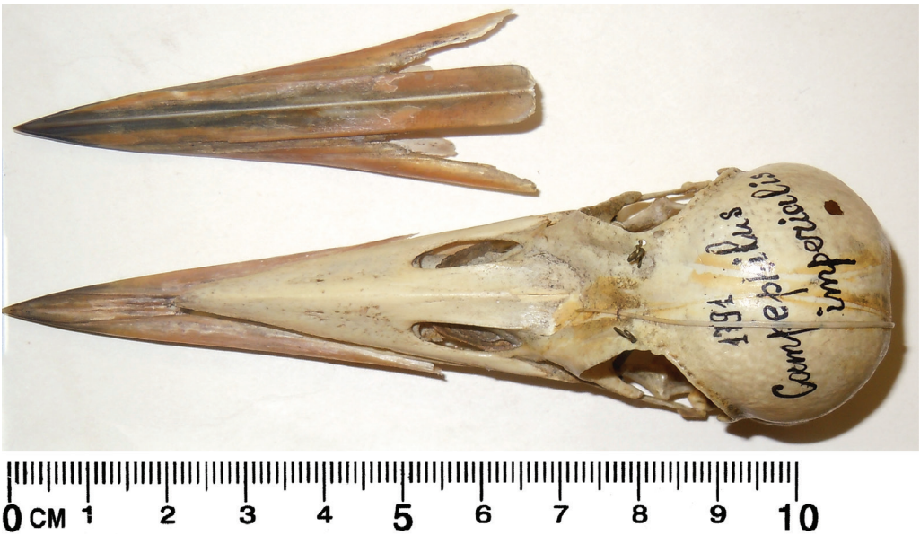
Figure 3. The ZISP skull (ZISP 1791), supposedly of Imperial Woodpecker Campephilus imperialis but actually Ivory-billed Woodpecker C. principalis , in dorsal view

American Museum of Natural History, New York (AMNH), United States National Museum, Smithsonian Institution, Washington DC (USNM), Museum of Comparative Zoology, Harvard University, Cambridge, MA (MCZ), and ZISP. All responded, and MCZ