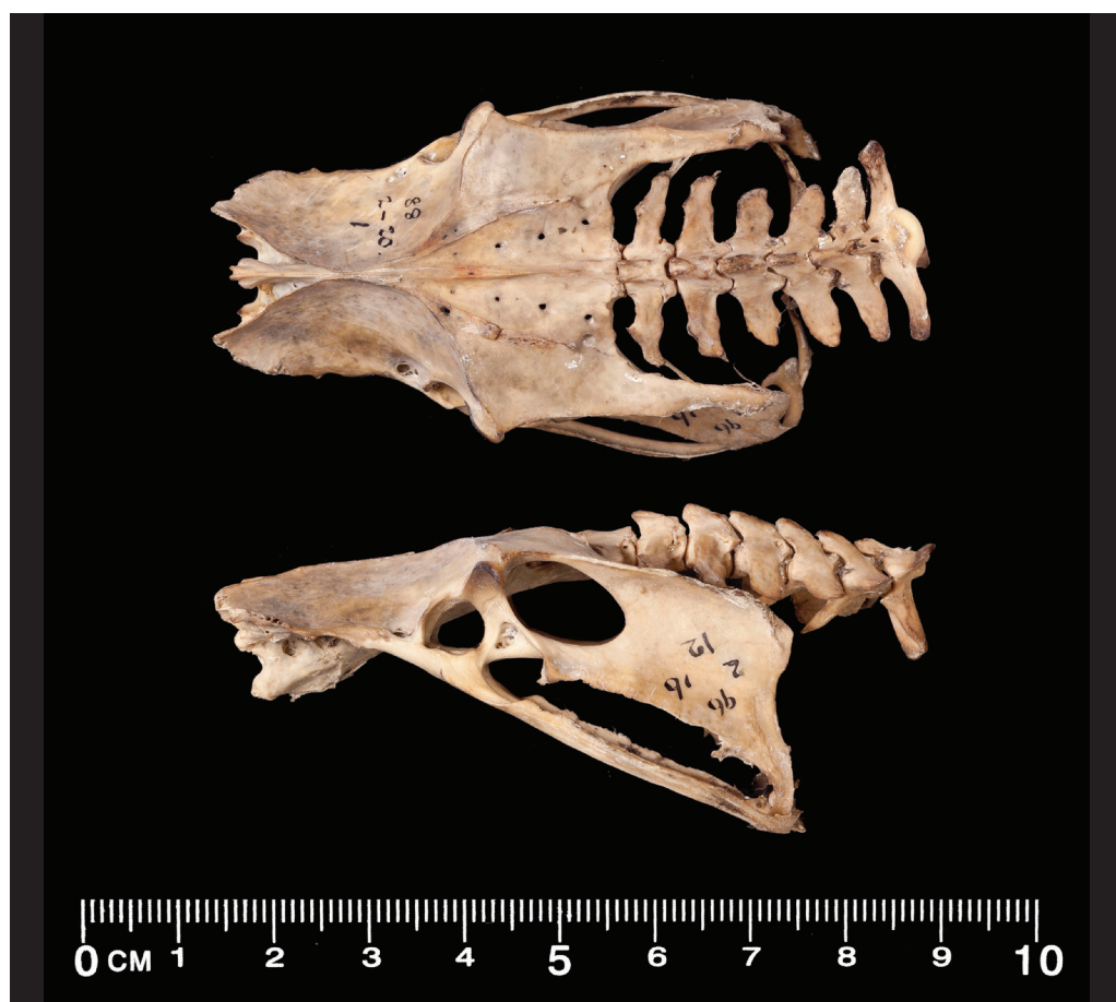
Figure 5. Pelvis of the unidentified NHMUK skeleton, illustrating the two different registration numbers inscribed on the same part

Although it was noted during examination of the specimen that its bill tip had some minor damage, even with the rhamphotheca in place its total skull length (105 mm) indicates it cannot be a C. imperialis (Table 1).