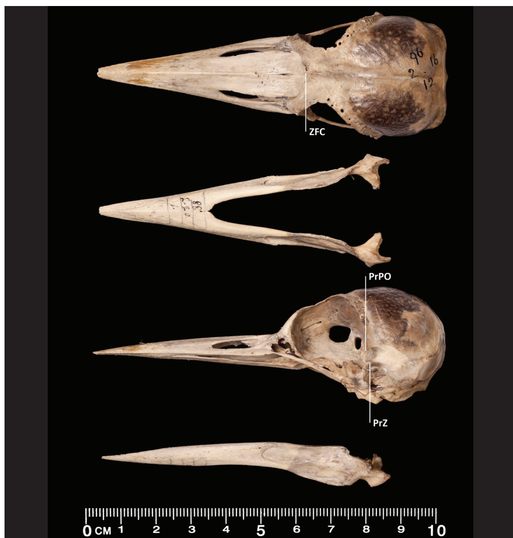
Figure 1. Skull of the unidentified NHMUK skeleton in dorsal and lateral views. ZFC: craniofacial flexion zone; PrPO: proc. postorbitalis; PrZ: proc. zygomaticus

presence of a rhamphotheca increases skull length by on average 17.28% (range 16.2–18.0%, n = 4 ). As the skull without rhamphotheca of the unidentified NHMUK skeleton measured 105.3 mm, this indicated that with its rhamphotheca it would have had a total skull length of c.123.5 mm. Using these results, a plot of maximum skull width against skull length with rhamphotheca clearly indicated that the unidentified NHMUK skeleton must be either a small individual of C. imperialis or a large C. principalis (Fig. 2).