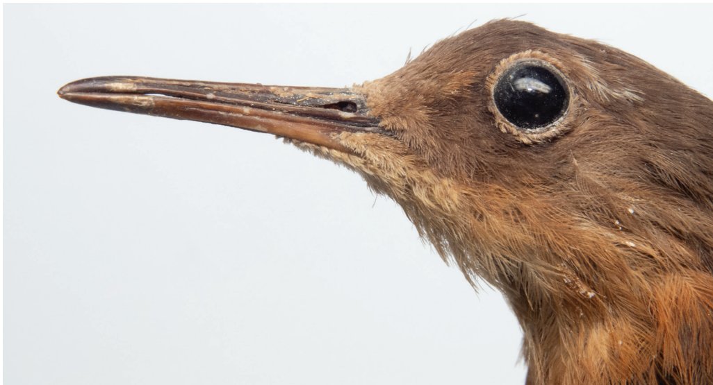
Figure 2. Tahiti Sandpiper Prosobonia leucoptera , RMNH.AVES.87556; note the gap in the bill, the shape of the nostrils, and the feathering on the mandible

tertials. Wings level with the tail tip. Head: russet-coloured from submoustachial region to breast. Bill base, throat and part of lores buff. Narrow eye-ring also buff. A small curved supercilium partially coloured (buff-)white (5–6 feathers) behind the eye. Crown, hindneck and neck-sides pale sooty brown. Upperparts: upper mantle similar to hindneck, sooty brown, lower mantle and back dark sooty brown, and rump and uppertail-coverts russet / ferruginous (like underparts). Underparts: breast to undertail-coverts russet-