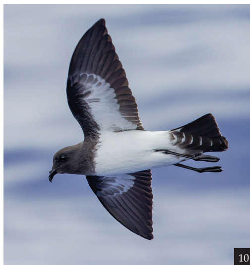
Figures 7–10. ‘Classic’ Titan Storm Petrels Fregetta [grallaria] titan , Rapa Island, Austral Islands, French Polynesia, November–December 2019. The plumage of ‘classic’ titan includes broad white fringes to the scapulars, mantle to rump, and upperwing greater, median and longest lesser secondary-coverts. Fig. 7 offers a closer look at the broad white fringes to the mantle to rump feathers, which are abraded and worn off on a few old, browner feathers. The bird in Fig. 8 has undergone head and body moult, with blackish-grey scapulars and mantle to rump, strongly contrasting with the mainly old, browner upperwing-coverts without white fringes. Note the sparse dark streaking on the body-sides in Fig. 8, but lacking in Fig. 10.

occur/s in East Polynesia away from Rapa and Marotiri, but Titan Storm Petrel apparently disperses a significant distance given these two records from much further north and east.