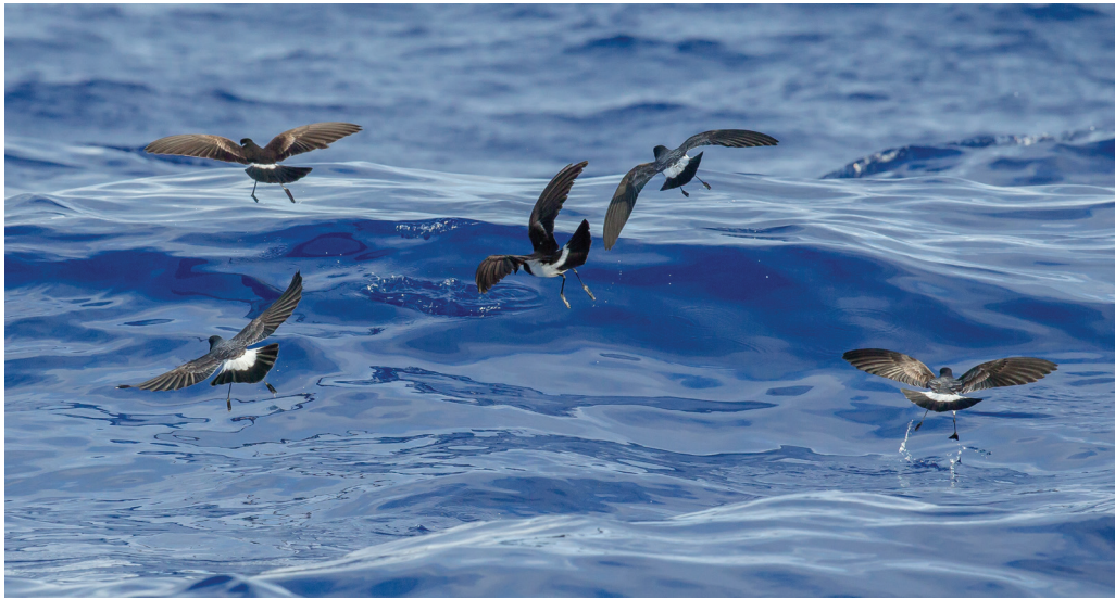
Figure 5. Two Polynesian Storm Petrels Nesofregatta fuliginosa (top and centre left) and three 'classic' Titan Storm Petrels Fregatta [grallaria] titan , Rapa Island, Austral Islands, French Polynesia, November 2019, showing the exceptionally large size of titan relative to other Fregatta , and approaching that of the particularly large Rapa form of N. fuliginosa

Petrels Nesofregatta fuliginosa (Fig. 5). On 24 October, two were seen when approaching Marotiri from the north-east, two were attracted to chum in calm conditions in five hours close to Marotiri and, on departure towards Rapa, four were attracted to the yacht's stern using a fish oil drip. However, c. 60 came to chum there on 24 November. Off Rapa observed throughout the survey period, with max. daily counts in each month involving c. 90 on 25 October, 120 on 12 November, and >100 on 3 December.