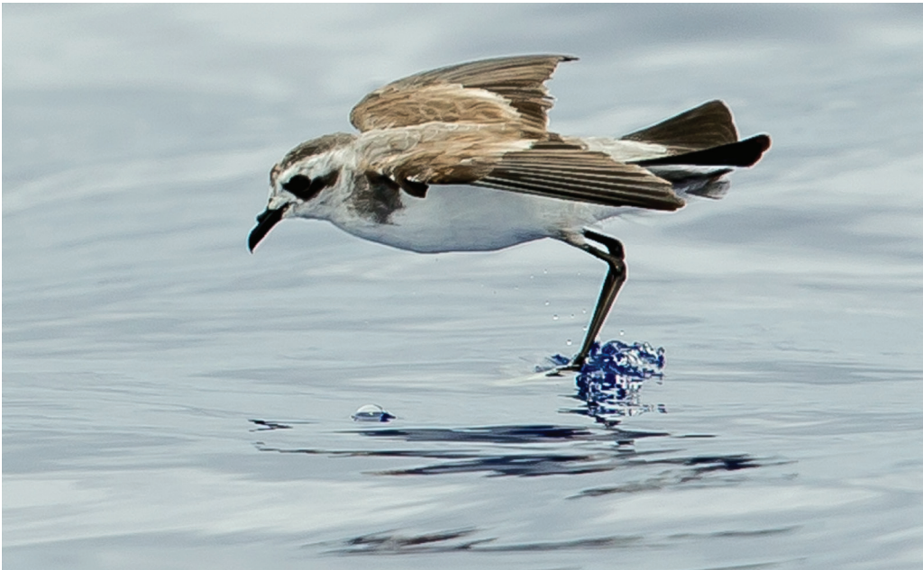
Figure 6. White-faced Storm Petrel Pelagodroma marina , off Rapa, Austral Islands, French Polynesia, December 2019; note combination of sullied pale greyish rump, moderately developed dark breast-side patches, and clean white underparts

of Rapa / Marotiri in September 2006, and a live bird and a dead individual on Rurutu Island in October 2010 (Thibault & Cibois 2017). Seven more records (of ten individuals) are available from across East Polynesia, including an undated sighting for the Line Islands (Thibault & Cibois 2017).