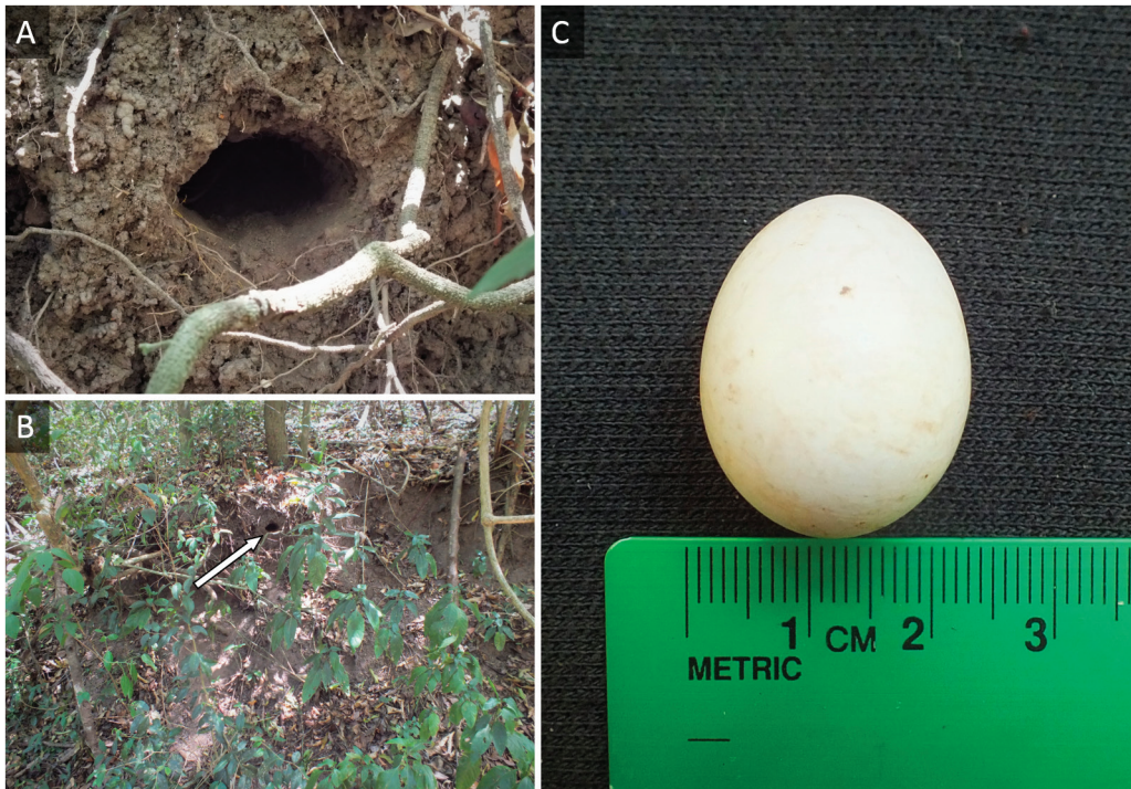
Figure 1. Nest entrance (A), location (B) and egg (C) of Ceará Leaf-tosser Sclerurus cearensis , FLONA Araripe, Barbalha, Ceará, Brazil, December 2019 (Cicero Santos)