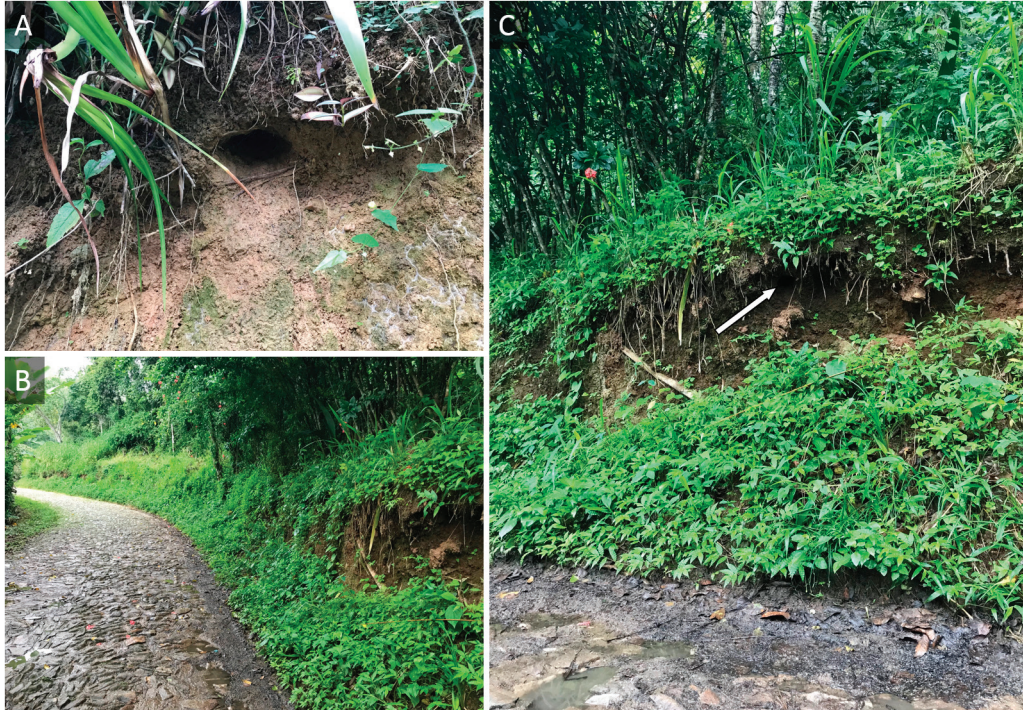
Figure 2. Nest entrance (A) and partial view of the nest site (B–C) of Ceará Leaf-tosser Sclerurus cearensis , Catolé, Ceará, Brazil, June 2020 (Cecília Licarião)