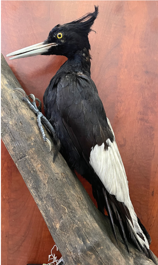
Figure 2. Female Imperial Woodpecker Campephilus imperialis in the Miami County Museum in Peru, Indiana (MCM-1919.021.0033.2); previously misidentified as Ivory-billed Woodpecker C. principalis