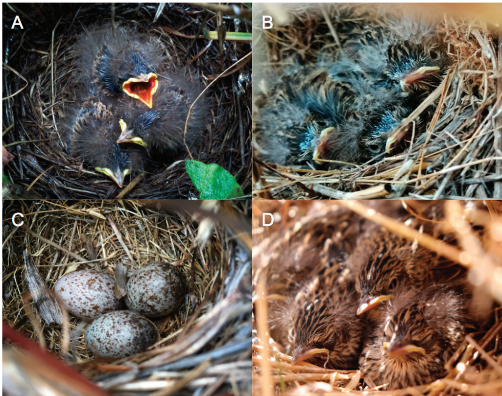
Figure 2. Nests of Hellmayr's Pipit Anthus hellmayri dabbenei in central Chile: (A) N1, Bulnes, with three nestlings c.8 days old; (B) N2, Los Sauces, with three nestlings c.10 days old; (C) N3, Los Sauces, with three eggs; (D) N4, Los Sauces, with four nestlings c.12 days old

treated these as independent feeding events, whereas calls separated by <5 seconds were considered the same feeding event, as this was the min. interval between deliveries detected using the trail camera.