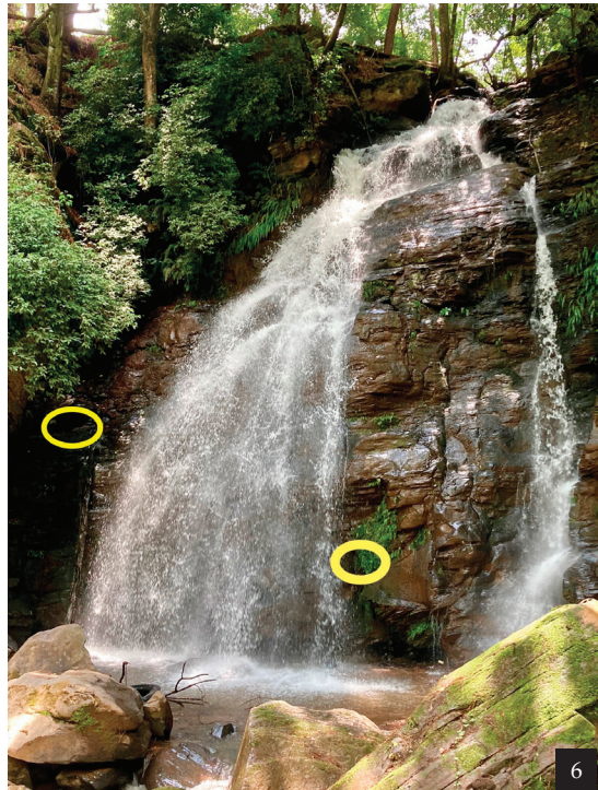
Figure 6. Salto de Agua, Yoricostio, Michoacán, Mexico, June 2022; left circle shows location of White-naped Swift Streptoprocne semicollaris nest, right circle shows location of White-fronted Swift Cypseloides storeri nest (Eric G. Horvath)

obscured many possible nest sites that I could not evaluate, but an evening watch might reveal swifts.