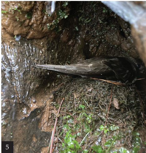
Figure 5. Adult White-fronted Swift Cypseloides storeri brooding small nestling in nest, Salto de Agua, Yoricostio, Michoacán, Mexico, June 2022