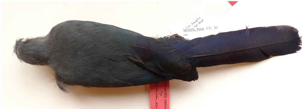
Figure 3. Holotype of Coua cristata maxima (MNHN-ZO-1950-392) in dorsal view (Guy M. Kirwan)