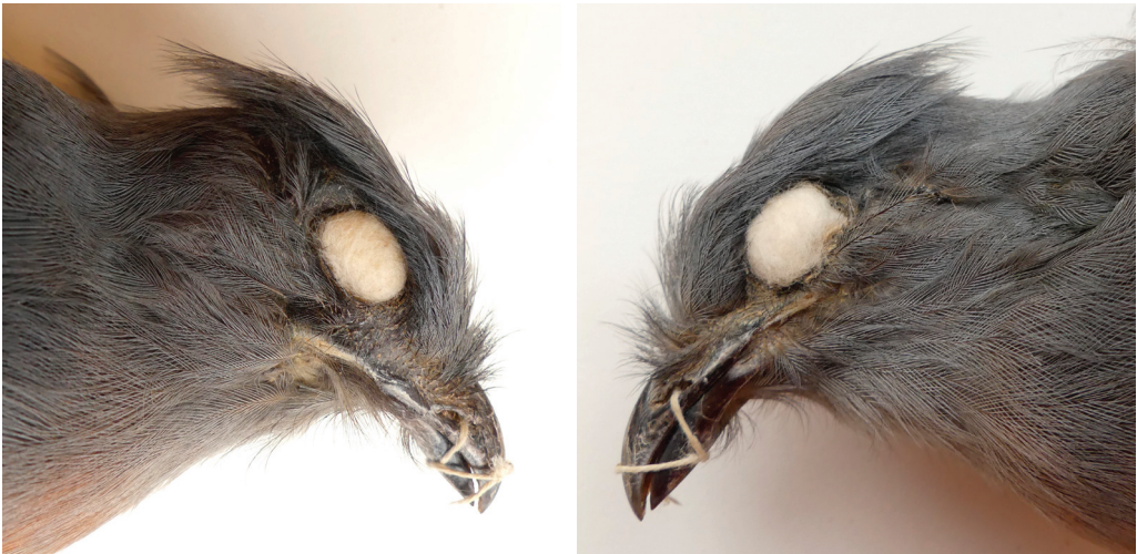
Figure 4 (left). Holotype of Coua cristata maxima (MNHN-ZO-1950-392), view of right side of head (Guy M. Kirwan)