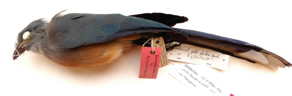
Figure 2. Holotype of Coua cristata maxima (MNHN-ZO-1950-392) in lateral view (Guy M. Kirwan)