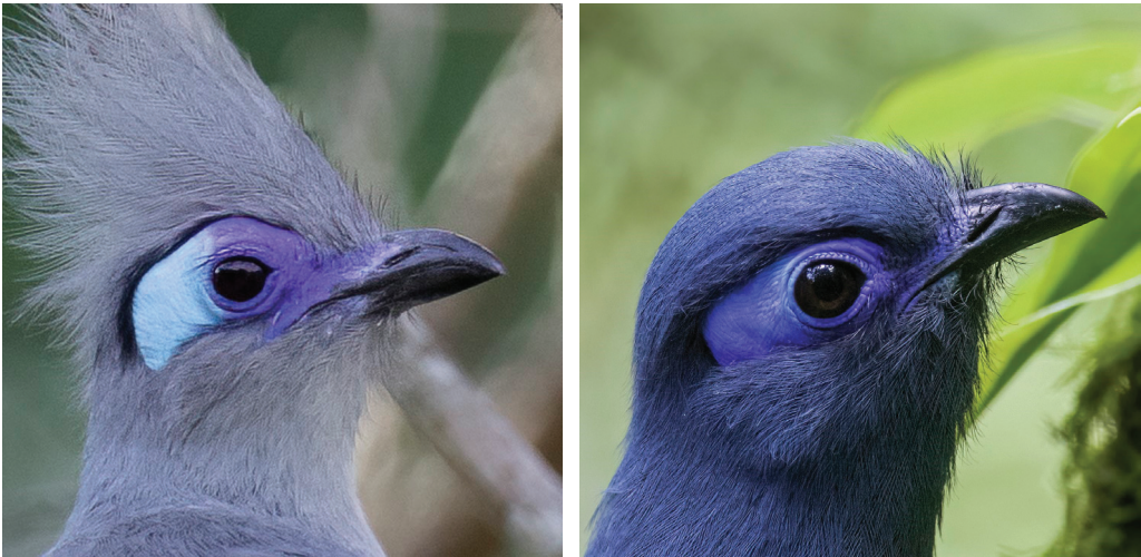
Figure 9 (left). Crested Coua Coua cristata cristata , Ankarafantsika National Park, October 2019 (detail) (Paul van Giersbergen)