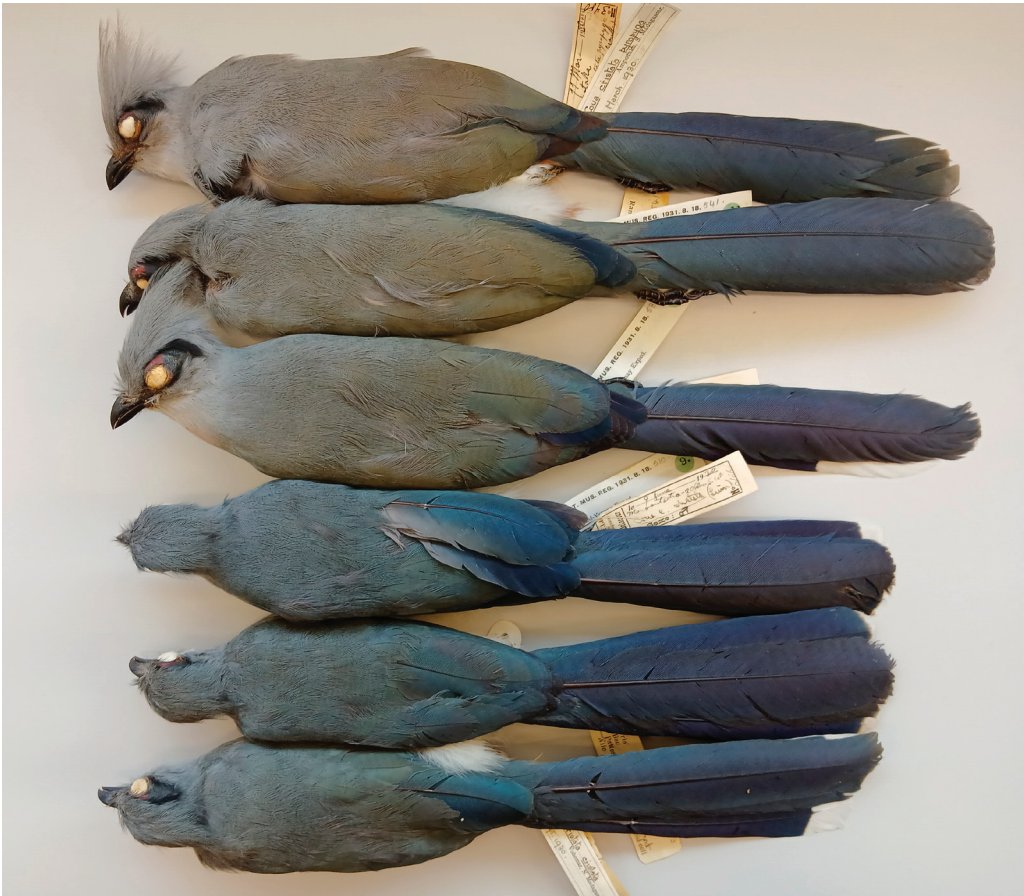
Figure 12. Dorsal view of the same three Coua [crystata] pyropyga and three C. c. cristata specimens, as in Fig. 11, in the Natural History Museum, Tring, top to bottom: NHMUK 1931.8.18.542, NHMUK 1931.8.18.541, NHMUK 1931.8.18.536, NHMUK 1931.8.18.510, NHMUK 1931.8.18.513, NHMUK 1931.8.18.515

than that it shared white ones with nominate cristata ; and (3) the known distance between the type locality of maxima and the easternmost occurrence of pyropyga is far smaller.