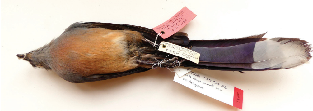
Figure 1. Holotype of Coua cristata maxima (MNHN-ZO-1950-392) in ventral view; note the loss of all undertail-coverts (Guy M. Kirwan)

which he collected at Fort Dauphin (now Taolagnaro or Tolagnaro), in far south-east Madagascar, on 18 February 1948 (Milon 1950); he later mentioned that he found it in humid forest (Milon 1952). He diagnosed it (in French; all quotations from the original description are our translations) on the basis of both size and colour. As its name indicates, the holotype in the Muséum national d'Histoire naturelle, Paris (MNHN-ZO-1950-392; Figs. 1–5), proved larger than the largest of the known subspecies of Crested Coua C. c. pyropyga (in the following sequence of measurements, in millimetres, maxima is first vs. pyropyga , with the latter's values expressed as means of 14 specimens): bill (from commissure) 30.0