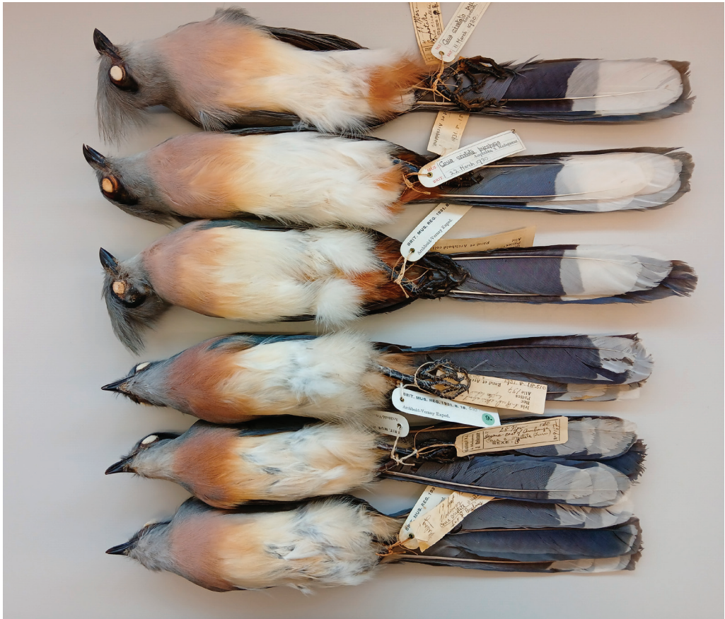
Figure 11. Ventral view of three Coua [crystata] pyropyga and three C. c. cristata specimens in the Natural History Museum, Tring, top to bottom: NHMUK 1931.8.18.542, NHMUK 1931.8.18.541, NHMUK 1931.8.18.536, NHMUK 1931.8.18.510, NHMUK 1931.8.18.513, NHMUK 1931.8.18.515

of the 21 specimens of nominate cristata , ten full-grown dumonti and 11 pyropyga held in the Natural History Museum, Tring, UK (NHMUK), was taken years before the holotype of maxima but has unreduced bare periocular skin (examples in Figs. 7–8).