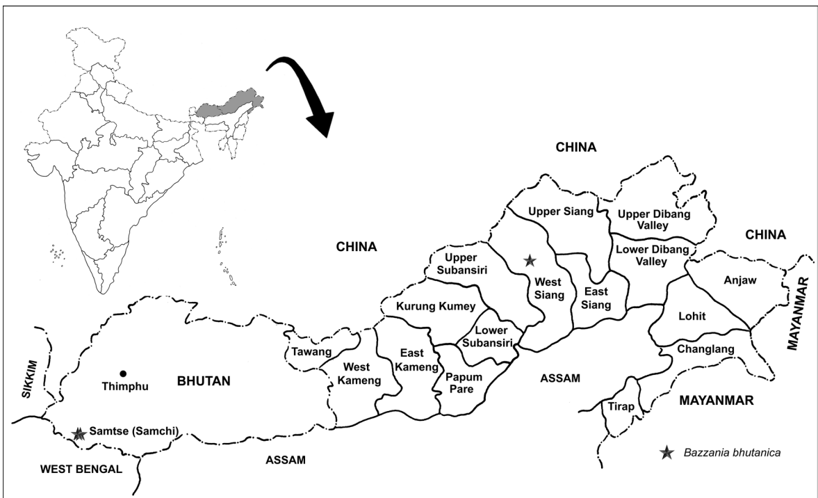
Figure 2. Map of Arunachal Pradesh (India) and Bhutan showing distribution of Bazzania bhutanica .

Bazzania bhutanica is characterized by 'Frullania type' terminal branching (Fig. 1: 2,3); stem undifferentiated