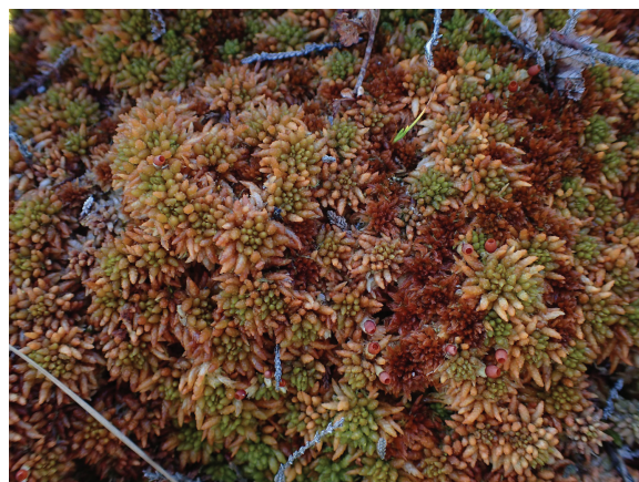
Figure 5. Sphagnum beothuk often grows in hummocks together with S. austinii as it did at the Swedish site, Toröds mossen.