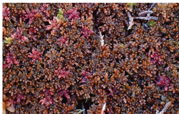
Figure 4. Wet Sphagnum beothuk growing at lower ground at Toröds mossen. Note the dark brown colour and the somewhat 5-ranked branch leaves.