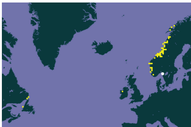
Figure 1. Distribution map of Sphagnum beothuk (yellow squares) from GBIF (GBIF Secretariat: GBIF Backbone Taxonomy. doi:10.15468/39omei, accessed via <www.gbif.org/species/7846758> on 2017-03-30) with the new record in Sweden marked (white circle). The species certainly occurs more abundantly in Britain and Ireland than shown on the map, but the exact frequency and distribution of S. beothuk in relation to S. fuscum in this area is under revision.