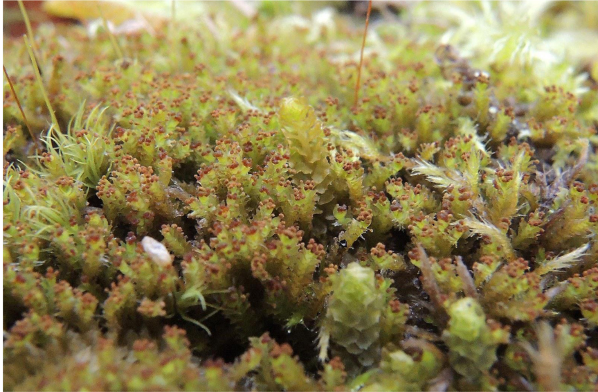
Figure 1. Lophozia lantratovae growing on a boulder in mixed mountain birch forest.

birches in moist to wet areas, often together with species like Lophozia silvicola H.Buch, Ptilidium pulcherrimum (Weber) Vain. and Dicranum montanum Hedw. We have seen material from 310 to 730 m a.s.l.