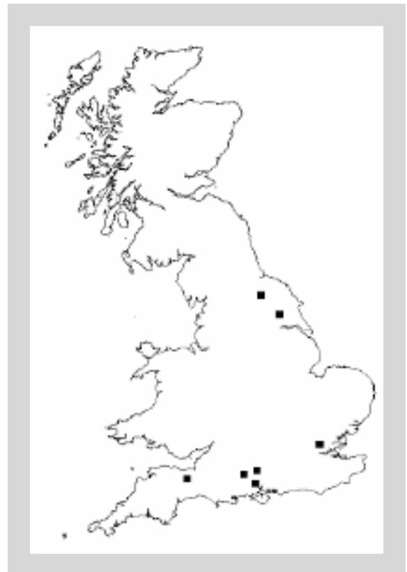
Figure 1. Location of the seven pheasant shooting estates in Great Britain where experimental spring supplementary feeding trials were conducted during 1997-2000.

Typical management on these estates was as follows: machine-incubated chicks were reared in brooder houses and transferred to woodland release pens at six weeks of age during July and August each year at least six weeks before the start of the shooting season on 1 October. Birds dispersed from pens over a 3-week period. They were first fed commercial grower pellets and then wheat from hoppers in woodlands and game