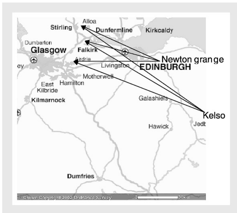
Figure 1. Section of southern Scotland showing the approximate race routes to three lofts in the Central Belt (indicated by arrows). Race 1 was from Kelso and Race 2 from Newtongrange. The map is based upon Ordnance Survey material with the permission of Ordnance Survey on behalf of the Controller of Her Majesty's Stationery Office © Crown copyright.

birds became part of the control group. The radios were then refitted onto two control birds.