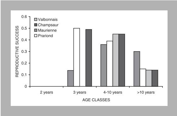
Figure 1. Female reproductive success estimated for the four different age classes in the four ibex populations in the Ecrins (Valbonnais and Champsaur) and Vanoise (Maurienne and Prariond-Sassière).

In the Ecrins and Vanoise Parks, no 2-year-old female raised a kid to one year of age (Fig. 1). No