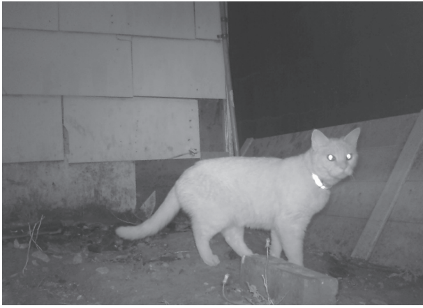
Figure 1. A night-time trail camera image illustrating the typical side view of cats captured based on the camera set up approach used in the Stillwater, OK study area; the image is of an orange tabby patterned cat, which we were able to determine because a single collared individual appeared in both day-time and night-time photos at one site.

primary sampling session, there were three secondary sampling sessions, each roughly one month apart and spanning three consecutive nights and days. We placed trail cameras at approximately 1 h before sunset on the first night and collected them 72 h later. We baited each site on the first night with 1.5–2 ounces of tuna and re-baited in a similar manner 1–2 h before sunset on each subsequent night of the sampling session.