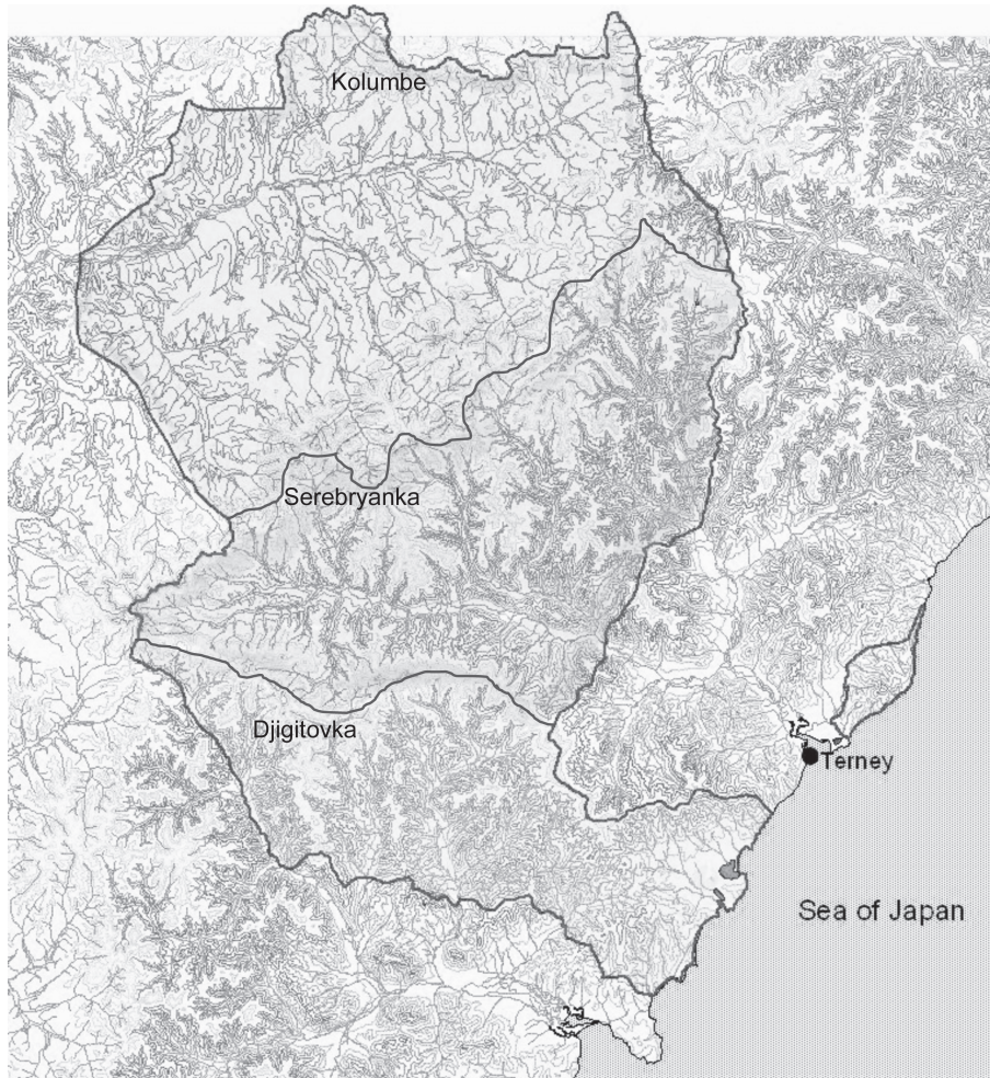
Figure 1. Map of Sikhote-Alin Zapovednik with Djigitovka, Serebryanka, and Kolumbe river basins delineated.

m perpendicular to the tiger's assumed pathway at a height of 0.5 m (Karanth et al. 2002). We deployed CamTrakker (CamTrak South Inc.) and Deercam (Non Typical Inc.) passive infrared cameras and replaced film and batteries regularly. We programmed camera traps to operate 24 h a day. We identified individuals from stripe patterns on their flanks, including adult and subadult tigers. We included all tigers identified in abundance estimates with the exception of cubs.