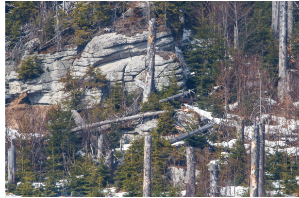
Figure 1. A typical rock formation of the Bohemian forest with a resting lynx (Photo credit: Rainer Simonis).

Since lynx show a crepuscular and nocturnal activity pattern, we used only the 12:00 UTC location (within a 30-min time window). The position of the noon location corresponds most of the time (>85%) to resting locations (Podolski et al. 2013, Heurich et al. 2014; to account for this uncertainty, we will use the term potential resting sites onward). To exclude effects of potential kills, we ran the analyses twice – once with all daytime resting sites and once only with resting sites that were used at least five days apart (Okarma et al 1997, Jobin et al. 2000, Belotti et al. 2015).