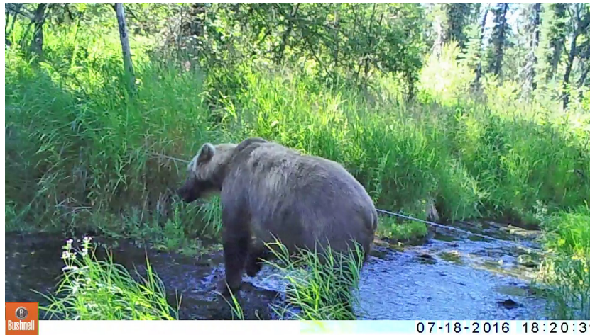
Figure 1. Still image from a video (Supplementary material Video A1) showing a brown bear that apparently inspected and then walked away from a wire deployed to obtain hair samples on Hansen Creek, Alaska.

It was not always possible to determine sex due to the lighting, camera angle and bear position, but of the 350 approaches, 28 female and 90 male bears were identified. Females avoided the wire more often than did males (39.3% of interactions versus 20.0%; Table 1; \chi^2 = 4.29 , 1 df, p = 0.038 ). There were 274 videos containing adult bears (including those in which sex could not be determined) and 65 videos containing yearling and spring cubs. Adult bears avoided the wire in 21.2% of the approaches, whereas cubs avoided the wire in 12.3% of them (Table 1; \chi^2 = 2.63 , 1 df, p = 0.10 ). The videos showed 298 individual bears, and 52 in groups from 2 to 4 bears. Individual bears avoided the wire 20.5% of the time, whereas bears in groups avoided the wire in 11.5% of interactions (Table 1; \chi^2 = 2.28 , 1 df, p = 0.13 ). The bears were least often detected in the day (Fig. 3). Of the 350 approaches analyzed, 23.7% were during daylight, 17.1% at dusk, 44.9% at night and 14.3% at dawn, indicating a very low approach rate in the day. Bears avoided the wire in 10.8% of the approaches in the day, 19.1% during crepuscular periods combined (16.0% at dawn and 21.7% at dusk) and 23.6% at night (Table 1; \chi^2 = 7.32 , 2 df, p = 0.026 ).