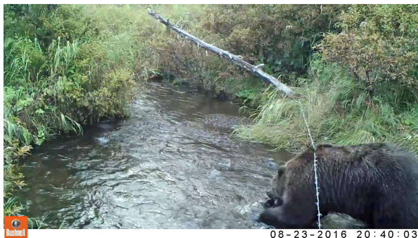
Figure 2. Still image from a video (Supplementary material Video A2) showing a brown bear that contacted a wire deployed to obtain hair samples while it was catching a sockeye salmon in Eagle Creek, Alaska.

Female bears avoided the wires more often than did males. This finding was unexpected because females often seem to be more tolerant of human-disturbed areas than males, and may even use human activity as a shield against male infanticide (Rode et al. 2006, Steyaert et al. 2016). Most females identified in videos were accompanied by cubs, which could make them warier of potential dangers while foraging in streams. For example, elk Cervus canadensis in Yellowstone National Park spent more time being vigilant