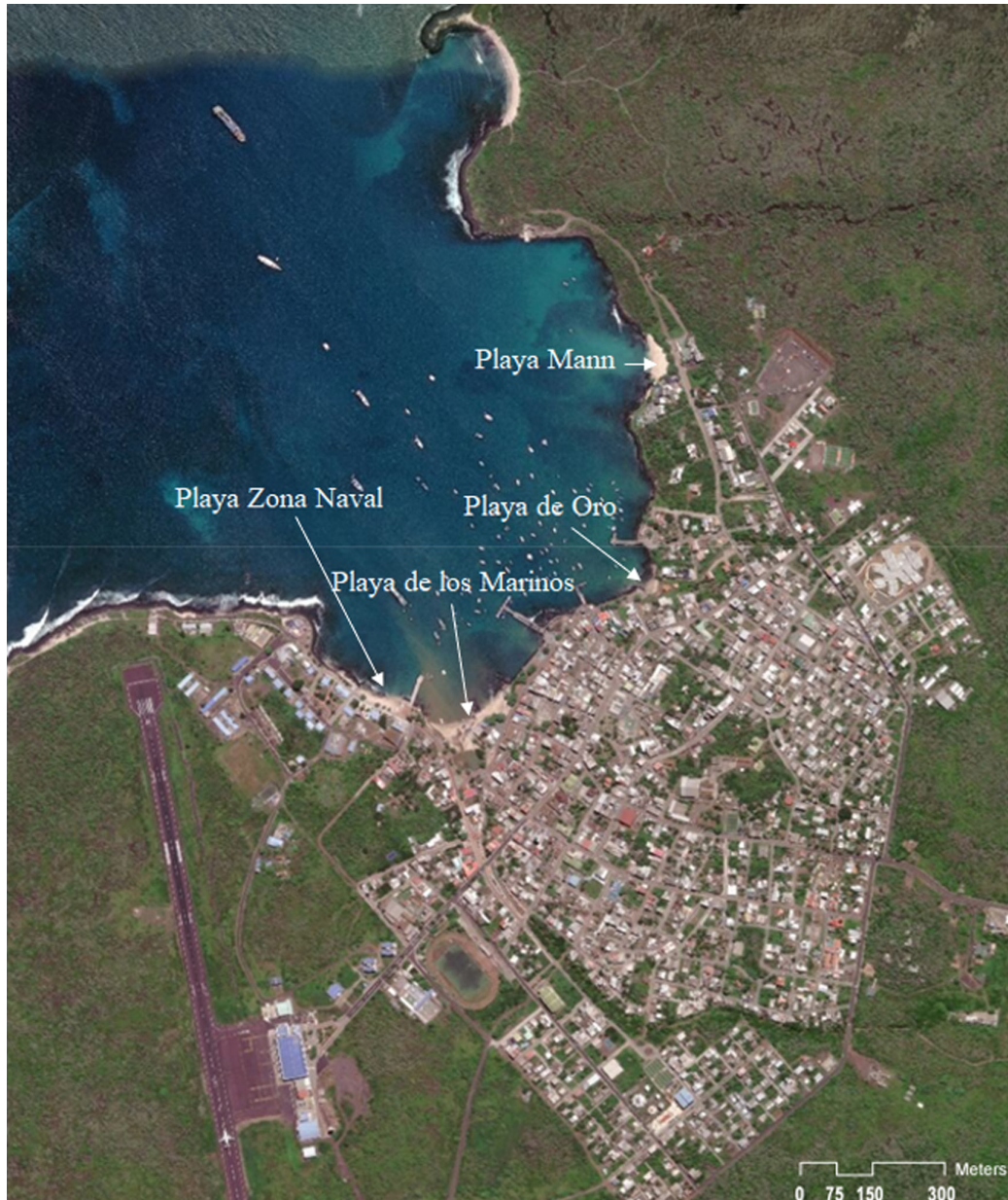
Figure 1. Map of Puerto Baquerizo Moreno showing the four El Malecón colony haul-out sites included in this study.

been used to study Australian sea lions living on Carnac Island (Orsini et al. 2006) and in a comparison of Australian sea lions on Carnac Island and Seal Island (Osterriender et al. 2016).