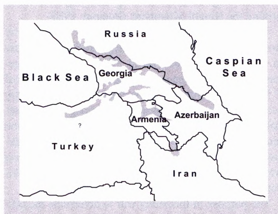
Figure 1. Distribution of the Caucasian black grouse (after Storch 2000).

The Caucasian black grouse is the only grouse species represented in Turkey. According to recent liter-