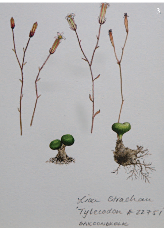
3 Tylecodon opelii . Artist: Lisa Strachan.

4 Tylecodon opelii in its habitat at Bakoondkolk. Note the dark green leaf surface and the maroon under surface. 5 Tylecodon opelii towards the end of the season, becoming yellowish and wrinkled (Bakoondkolk). 6 Tylecodon opelii becoming yellowish, growing among Oophytum nanum (Bakoondkolk).