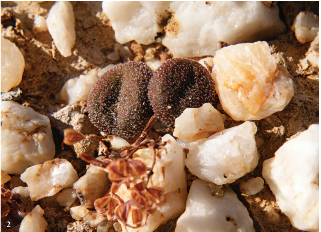
1 Tylecodon nolteei growing at Kareeberg. 2 Tylecodon peculiaris from Kareeberg.