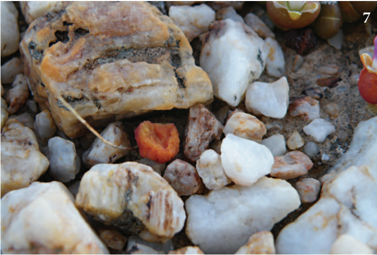
7 Tylecodon opelii just before its leaves are shed, reddish raisins drying in the sun. 8 The quartz gravel habitat of Tylecodon opelii .