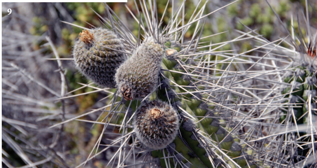
9 These images of Eulychnia chorosensis were taken on 6 November 2006 at Punta Choros, and show the bristly hypanthium.

the rank of species, when he described Eulychnia procumbens for a quite different plant. Backeberg (1977, Fig. 114) reproduces a good photo of his Eulychnia procumbens . It is believed to be a small growing form of Eulychnia breviflora similar to those found near Bahía Inglesa and illustrated by Leuenberger & Eggli (2000, Fig. 12). It was dismissed by Ritter as a synonym of Eulychnia breviflora .