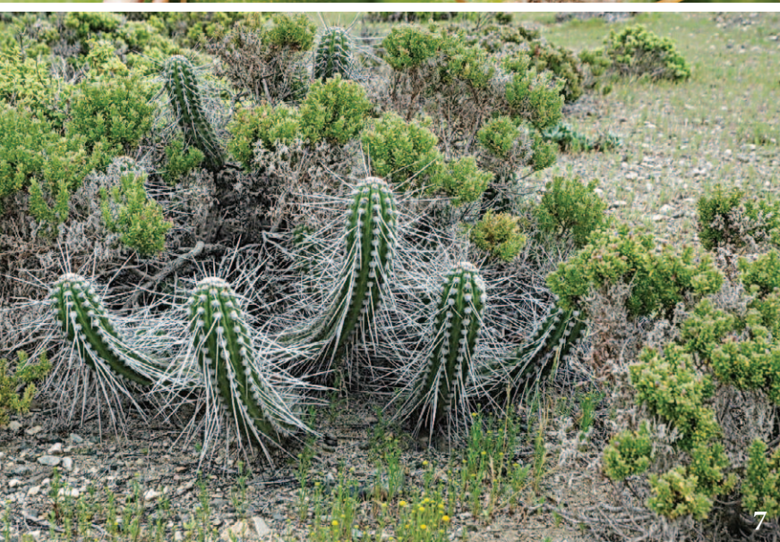
6 A seedling of Eulychnia taltalensis , PH255.02, from the coast between Punta Plata and Paposo, at 40m, in cultivation, displaying the brown areole felt. 7 Taken on 21 October 2004 in the Llanos de Choros, this picture captures the first time that the author (PK) observed Eulychnia taltalensis in habitat and started the search for its identity.

suiting to higher levels of moisture availability and has displaced Eulychnia iquiquensis (Figures 3, 4). Eulychnia iquiquensis is the most drought resistant member of the genus and perhaps less suited to wetter conditions. An alternative theory is that Eulychnia taltalensis is of hybrid origin between Eulychnia iquiquensis and Eulychnia breviflora and it has hybrid vigour.