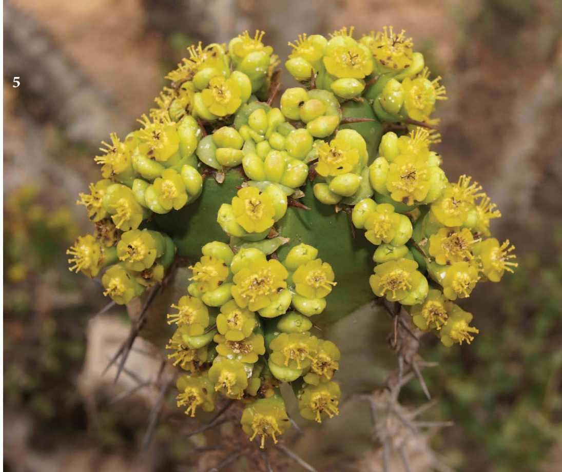
5 Close up of flowers of Euphorbia momccoyae .