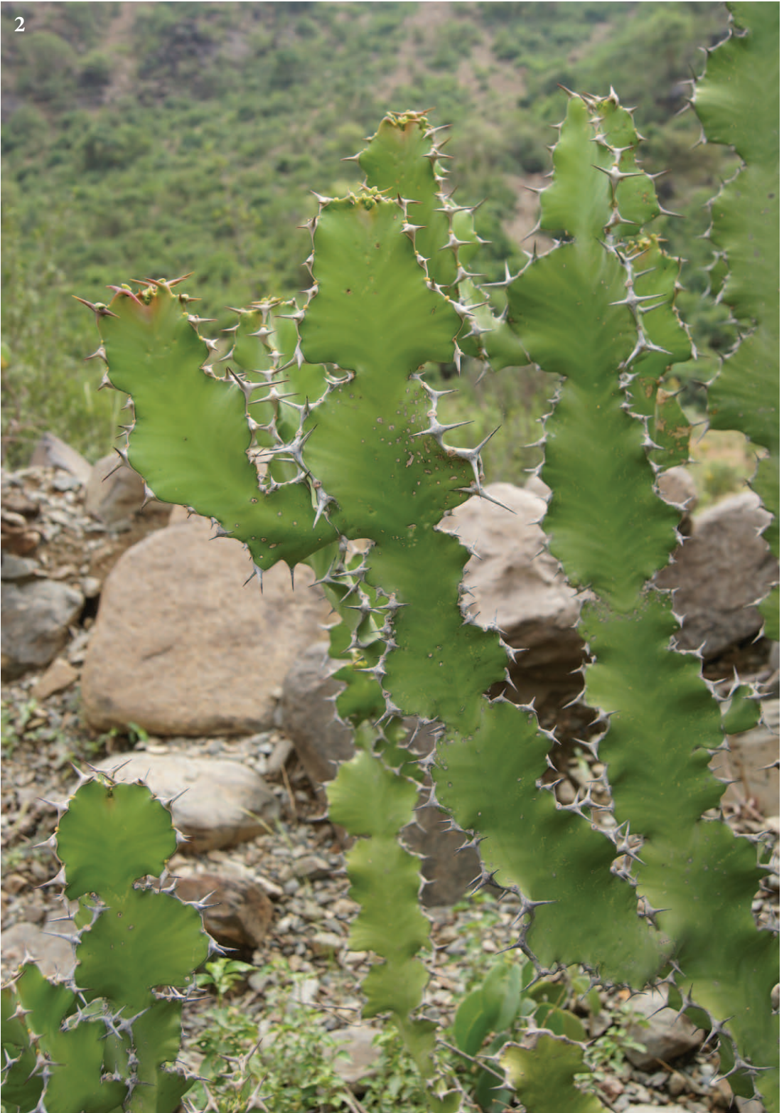
2 Euphorbia cactus , from the base of the Raidah Escarpment, southern Saudi Arabia. Notice the very different stem morphology, with this species possessing deeply constricted and very narrowly winged stems, unlike E. momccoyae .