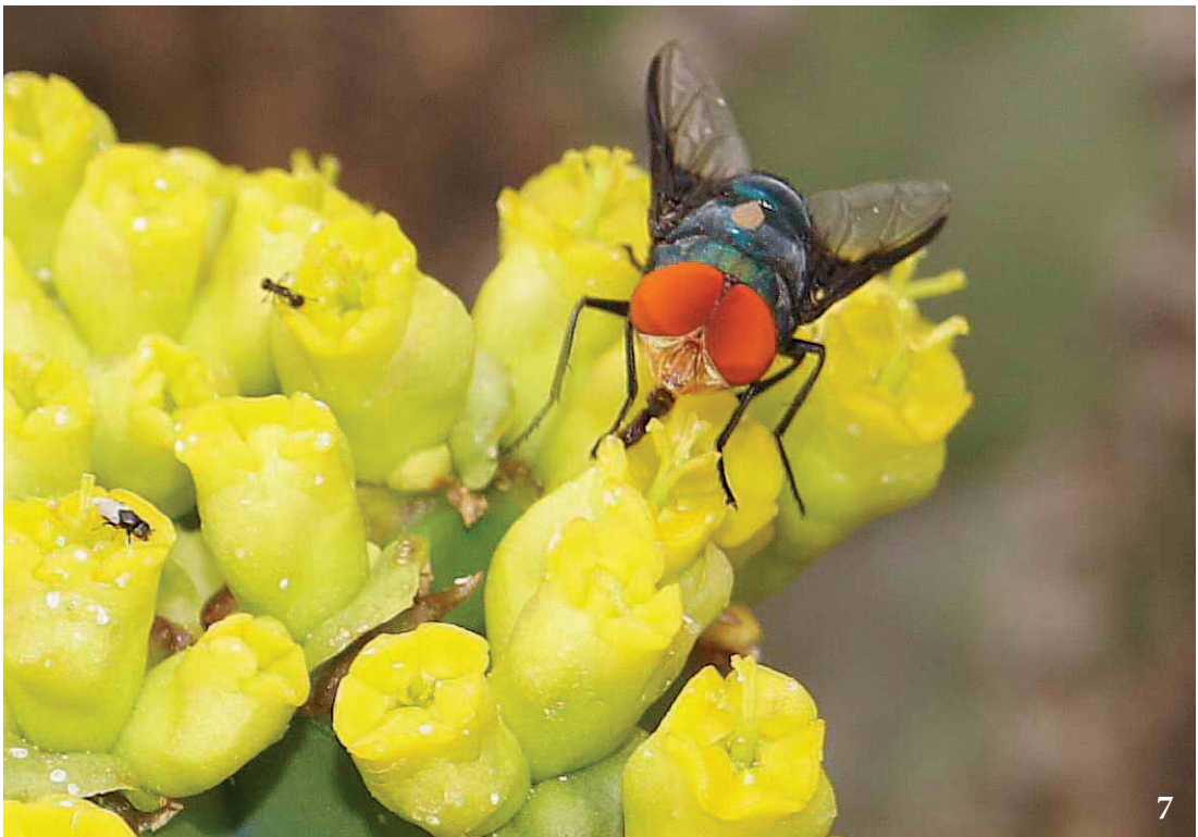
7 Close-up of flowers of E. momccoyae , showing ant and fly activity.

confluent, forming a continuous grey margin along the stem-angles. Leaves broadly deltoid, 2–3 mm long, 4–5 mm wide, rapidly deciduous. Flowering cymes axillary on the angles of recent growth, produced in groups of three from each flowering eye, on a peduncle 2.5–3 mm long. Cyathia actinomorphic, produced in groups of three, the central, male, opening first, the two flanking female cyathia opening later. Involucres broadly conical,