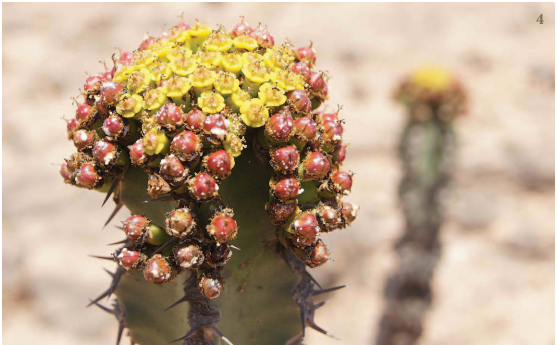
3 General shot of Euphorbia momccoyae at its type locality, growing with E. balsamifera ssp. adenensis . 4 Euphorbia momccoyae seed capsules.

botanical workers had ascribed these plants to E. cactus Ehrenb., which is known from the Yemen, Eritrea and the Kingdom of Saudi Arabia (Fig. 2). Over the years, McCoy had spent a great deal of