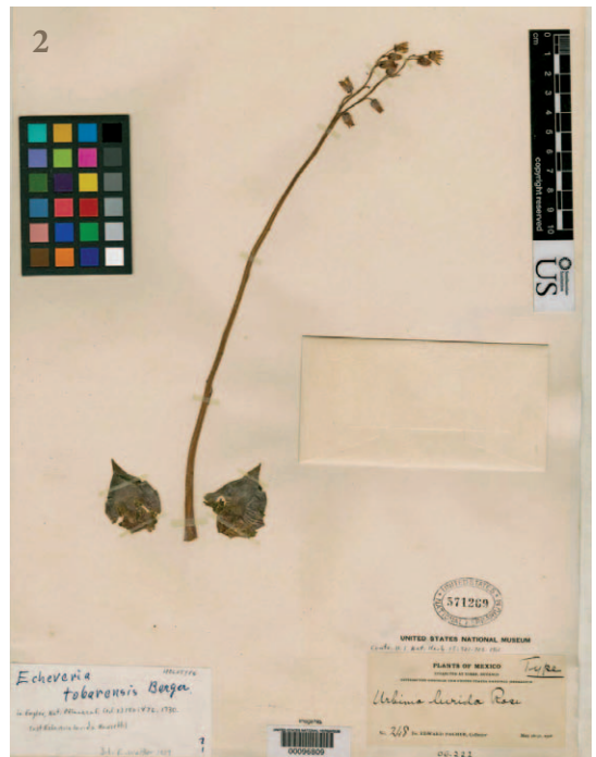
2 Herbarium sheet of Palmer 248 at the U.S. National Herbarium.