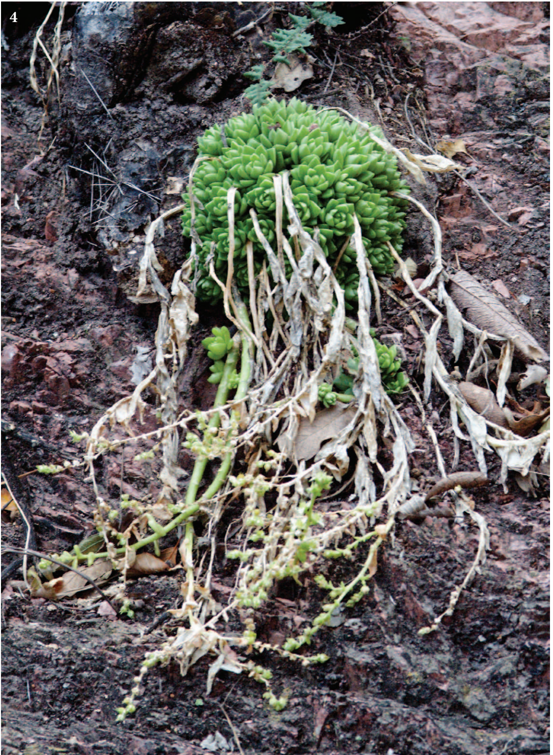
4 A cluster of Sedum glabrum with dried inflorescences growing on the shady canyon walls.

abandoned mine site some nine miles along the dirt road from Tepehuanes to Topia. Several hours' search in the deep canyon revealed only Echeveria paniculata . In 1976 I again visited the locality,