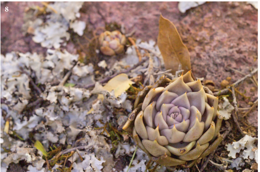
7 A beautiful adult specimen of Echeveria tobarensis growing on top of a mossy rock. 8 The similar colors of rock, lichen and plant make it difficult to spot the rosettes of Echeveria tobarensis .

genera consisting of only a few species and the three were moved back into the genus Echeveria as E. agavoides , E. purpurorum and E. tobarensis . The genus Echeveria is currently divided into 17 series (Walther, 1972; Kimmach, 2003).