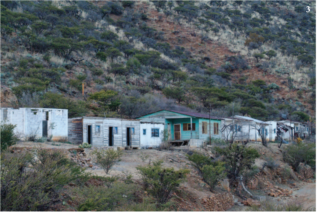
3 Abandoned houses in the old mining town of Tovar (2001).