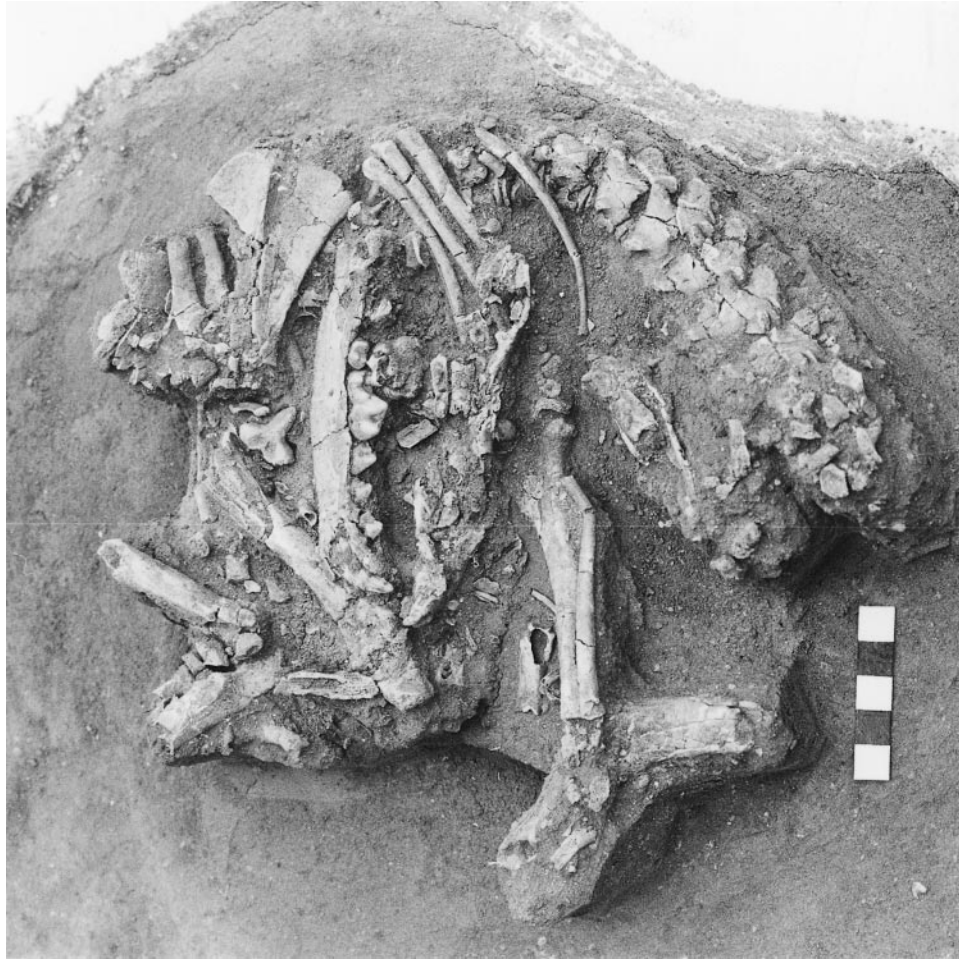
FIGURE 2.—Ora-849 dog burial exposed in plaster jacket, with 5 cm scale.