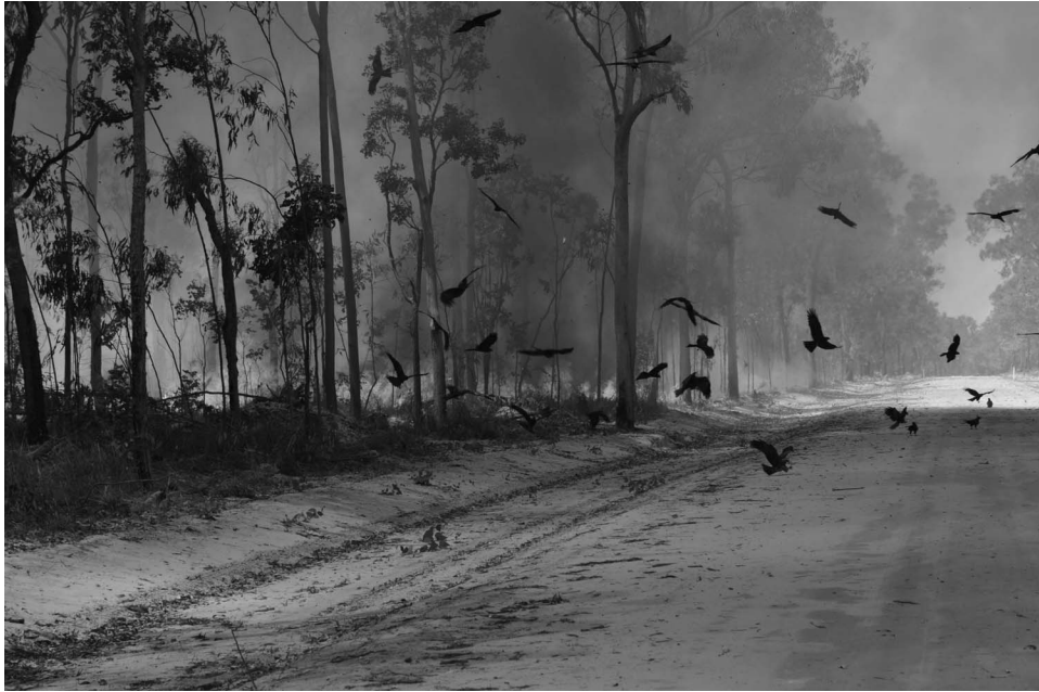
Figure 1. Black Kites at bushfire in Queensland.

typically describe the behavior as intentional, but others who have heard of fire-spreading often believe it to be accidental 2 . We characterize local ecological knowledge of fire-spreading as follows. Raptors fly into active fires to pick up smoldering sticks in talons or beaks, transporting them up to a kilometer away and dropping them either in brush or in grass. Sticks may be from human cooking fires or from burning or smoldering vegetation. The imputed intent of raptors is to spread fire to unburned locations—for example, the far side of a watercourse, road, or artificial break created by firefighters—to flush out prey via flames or smoke. The behavior may occur once or repeatedly during the fire, by a single bird or by a small percentage of the overall raptors present. Attempts may be unsuccessful, with burning sticks dropped short of unburned areas or dropped but not igniting vegetation.