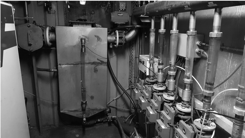
Figure 3. Milking apparatus to separate water and methane.

pump to the pipe system. Seeing the dairy technology on a neighboring farm, Per realized that a milking machine's purpose is to separate air from milk and reasoned that the machine could also do the inverse and separate liquid water from methane gas. His repurposing of the milking machine to methane production is an apt example of what we call undomestication (Figure 3). An apparatus from the global complex of cattle domestication, when redeployed in methane production, yields a wilder form of multispecies sociality, characterized less by simplification, intimacy, and control, than by proliferation and haphazard collection.