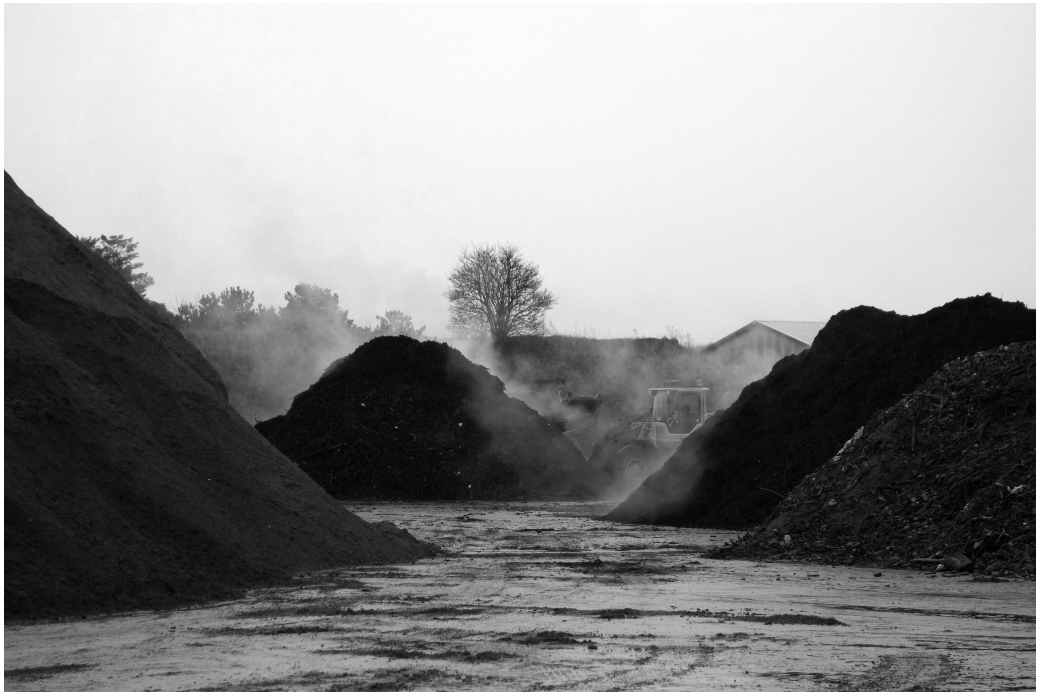
Figure 4. Thermal mist rises from compost heaps at AFLD Fasterholt.

weeds and the eggs of exotic, Iberian slugs ( Arion vulgaris ) are said to perish at 70 degrees Celsius. Weeds and trash animals, such as slugs, are pests in the eyes of private gardeners, who are the intended end-users of the mulch produced. Only a slug-free mulch can become a product. Armed with thermometers at the end of meter-long metal rods, the operators of the bulldozers prod the compost mounds to ascertain when to ventilate them, leveraging bacterial production to exterminate the slugs.