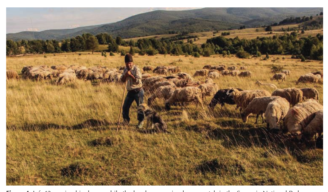
Figure 4. Inf. 42 grazing his sheep, while the loyal companion keeps watch in the Semenic National Park.

Nowadays, there is a growing general interest in LGDs around the world. The remaining breeds are seen as important cultural icons of pastoral communities, but also as important tools for the conservation of large carnivores (Linnell and Lescureux