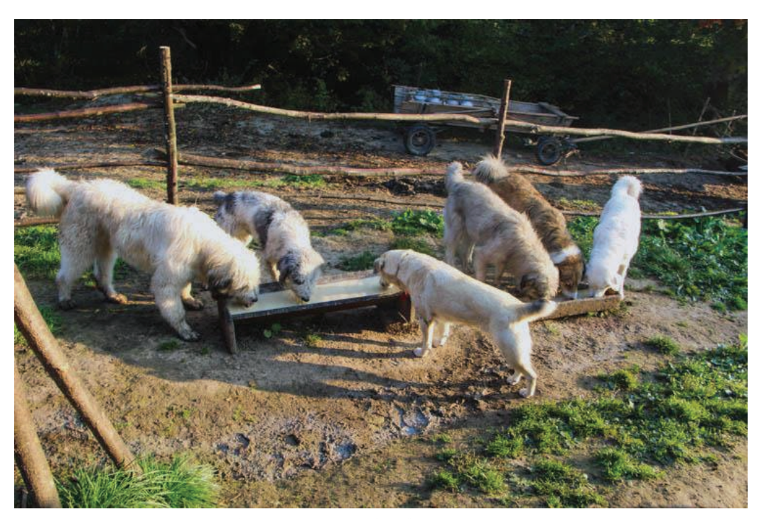
Figure 3. LGDs at supper eating whey, in Maramures.

It is a seldom bark. Whilst when they bark at the wolf it is more alert. They are very furious. (Inf. 45)