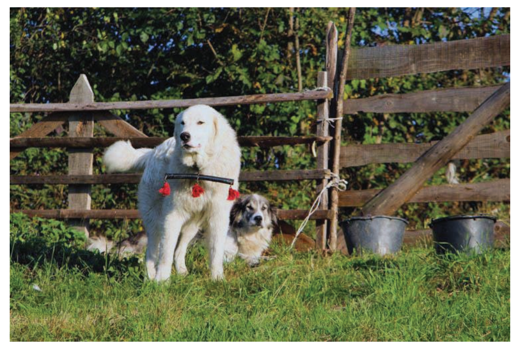
Figure 1. A Romanian White Shepherd Dog in the village of leud (Maramureă) wearing a yoke ( jujeu ). The red tassels have an apotropaic role, protecting him from the evil eye.

de Drept Vechi Românesc 1962) mentions for the first time the use of LGDs in the Romanian Principalities. This legislative code combines canonical and secular laws of local Romanian customs along with the Byzantine legislative codes. Beyond its cultural and linguistic importance, this code also contains a chapter entitled Pentru luptarea a dobitoacelor și pentru vătămarea lor. Glava 308 (On animal fights and the injuries brought upon them. Amendment 308). In this chapter, there are three articles related to the protection of LGDs. The first article (Zac. 65) forbids the organization of dogfights under the punishment of ten lashes with a stick. The second article (Zac. 66) prohibits the killing of a type of dog called câinele păstoresc, ce să zice dulău de turmă de oi (a shepherd's dog that is also called a sheep flock dog); the perpetrator is obliged to pay double the value of the dog. The third article (Zac. 67) strictly forbids the poisoning of LGDs, the punishment for which was restitution double the value of