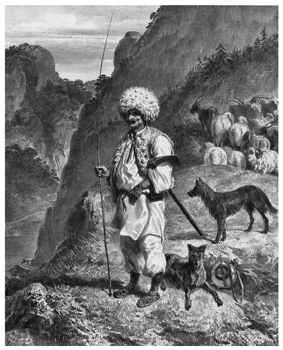
Figure 5. A lithography made by Auguste Raffet (Nineteenth Century), portraying a Romanian shepherd from Banat and his two dogs.

2015), with unique conservation value (Gehring et al. 2010). We have found that the Romanian herders in all the investigated sites could tell the presence and type of predators in their vicinity by the type of barking their dogs used. By using this method, the herders could react and prepare better for a possible encounter with large carnivores and could avoid livestock depredation. The TEK behind herding and LGD use is rich and still alive in many