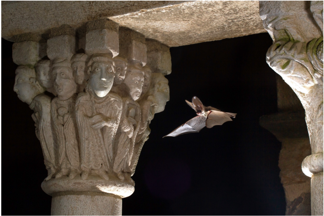
Figure 4. Great long-eared bat Plecotus austriacus returning to his/her roost in the Sant Pere de Rodes monastery. This ninth century building is home to the largest known colony of this species in Catalonia, Spain.