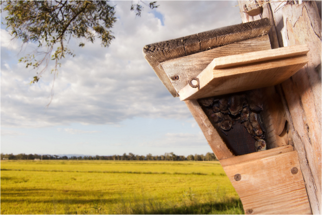
Figure 3. Soprano pipistrelles Pipistrellus pygmaeus roosting in a wooden bat box installed by local farmers in a rice paddy in the Ebro Delta (Catalonia, Spain) to aid in the control of pest arthropods (see Puig-Montserrat et al. 2015 for more information about bats and farmers in this biocultural landscape).

2010; Russo and Ancillotto 2015; Voigt et al. 2016; Figure 4). Furthermore, as human numbers increase and people encroach deeper into remaining natural habitats, human-bat interactions are becoming more frequent, with often undesirable consequences to both humans and bats. Problems related with infectious diseases are an infamous example. The white-nose syndrome, a severe condition caused by a pathogenic fungus introduced to North America by human travel, has severely hit several hibernating North American bat species, inducing steep population declines (Frick et al. 2016). On the other hand, several high-profile zoonotic diseases, the most notorious of which being COVID-19, have directly or indirectly been associated with bats and have caused enormous impact on global human health and national economies (Rocha et al. 2021a; Schneeberger and Voigt 2016; Zhou et al. 2020). Even