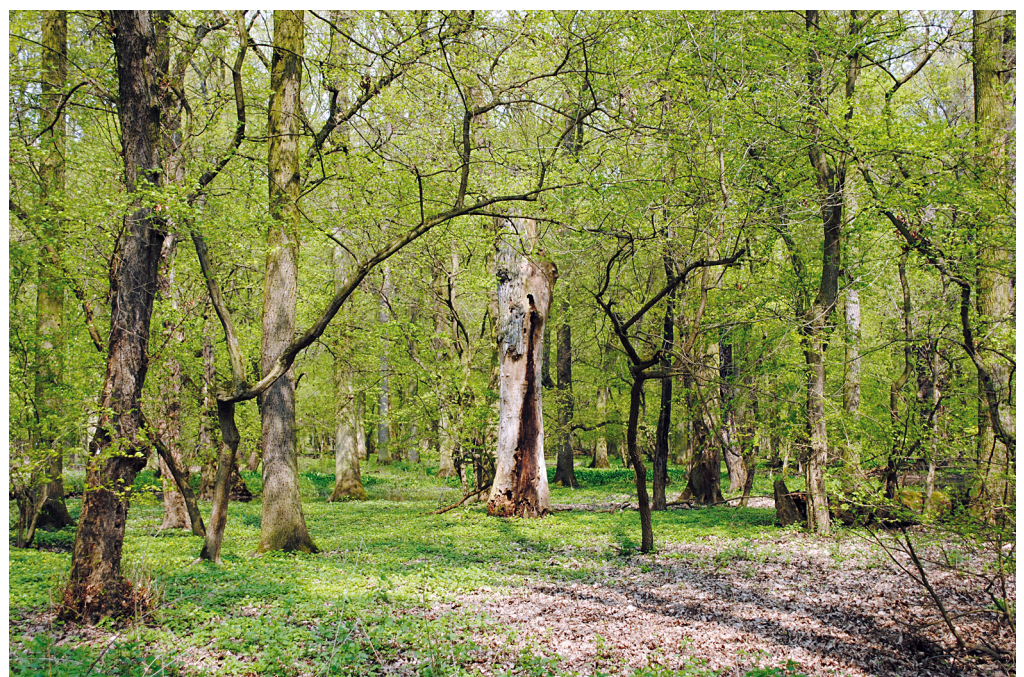
Fig. 1: Closed-canopy forest with interspersed old oaks at the Pohansko study site

A total of 322 specimens representing 47 taxa from 15 families were identified (Tab. 1). FITs yielded 165 specimens belonging to 40 taxa and 14 families. None of the species captured by the FITs were particularly abundant, only some species were present in relatively high numbers: Parasteatoda lunata (Clerck, 1757) (9 specimens), Anyphaena accentuata (Walckenaer, 1802) (8), Porrhomma oblitum (O. P.-Cambridge, 1871) (8), Leptorchestes berlinensis (C. L. Koch, 1846) (8) and Platnickina tincta (Walckenaer, 1802) (8) (Tab. 1). FITs exclusively yielded 27 spider taxa. Most species captured by FITs were Linyphiidae with nine species and a group of species