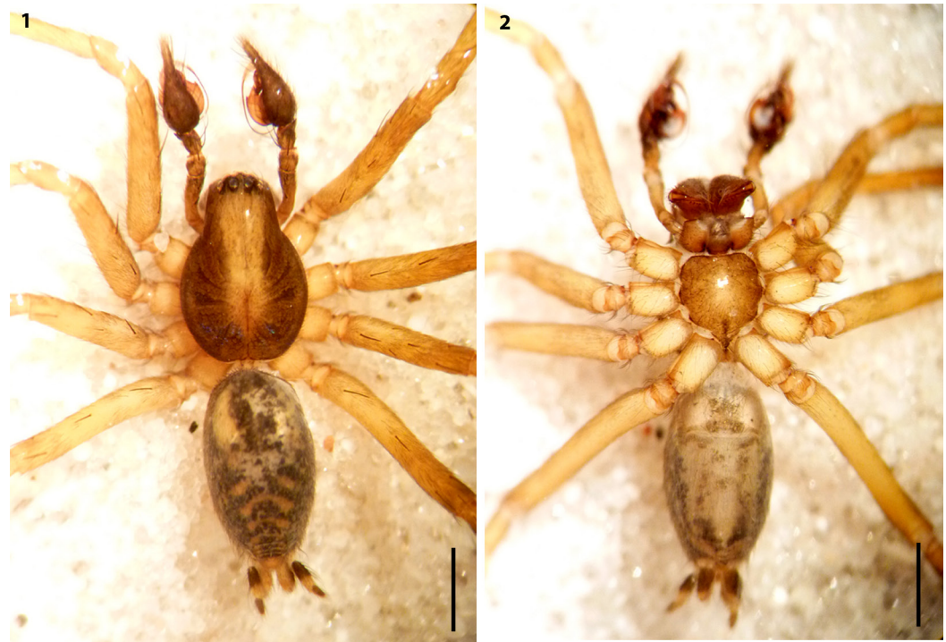
Figs 1–2: Histopona kurkai sp. n., male holotype, habitus, dorsal and ventral views, scales: 1.7 mm