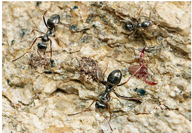
Fig. 2: One individual of Allochernes solarii crawling on a stone in a Formica gagates nest in Slovakia

The genus Allochernes Beier, 1932 includes 33 species and one subspecies distributed mainly in the northern hemisphere. So far, 15 of them have been discovered in Europe (Harvey 2013). Allochernes solarii (Simon, 1898) can be considered as a rare species, since it has been found, until the current study, only in the north of Italy, Sardinia and in the south of France (Gestro 1904, Leclerc 1979, Gardini 2000, 2004) (Fig. 1). The species was originally described as Chelifer solarii by Simon (1898) from Monte Capraro near Tortona, Piedmont, Italy and subsequently transferred to the genus Allochernes by Beier (1932). Gestro (1904) mentioned its occurrence in Sardinia which was questioned by Lazzeroni (1969a). Lazzeroni (1969a) recorded A. solarii from Montecchio near Verona, Venetia, under a stone next to a mountain station. Leclerc (1979) published a record from a small cave with colony of bats located in Ruoms à Labeaument, Ardèche, France. However, Leclerc's (1979) identification of A. solarii is doubtful since the author indicated differences in characters between the French specimens and the description in Beier (1932). Records of the species